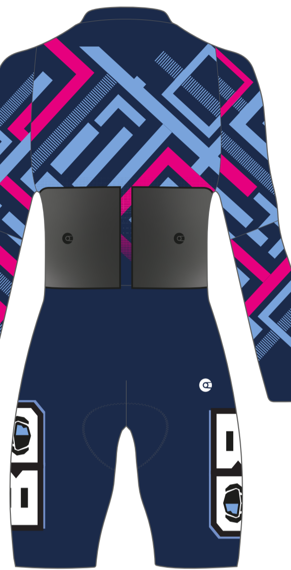
TRACK POCKET DESIGN