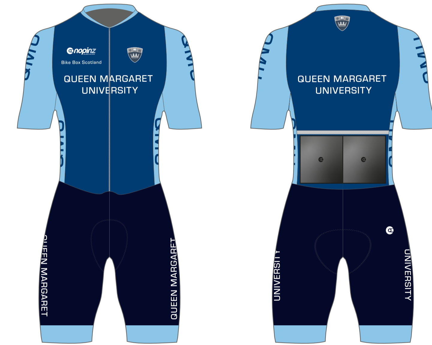
PRO1 ROAD RACE SUIT