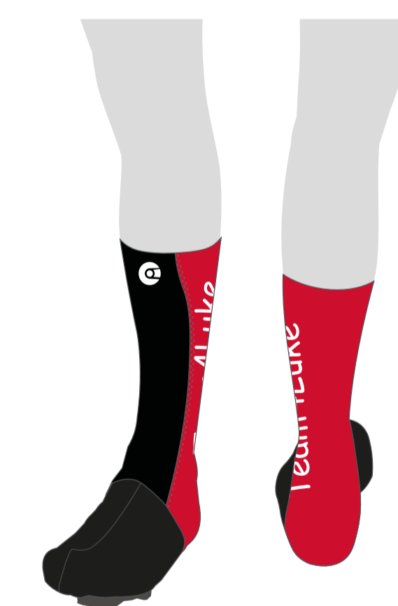
FLOW COVERS (UCI)