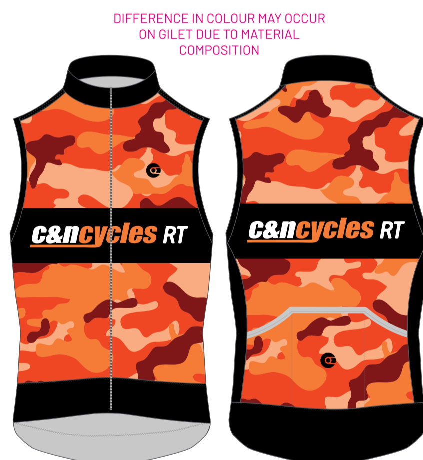
PRO-1 EVO GILET