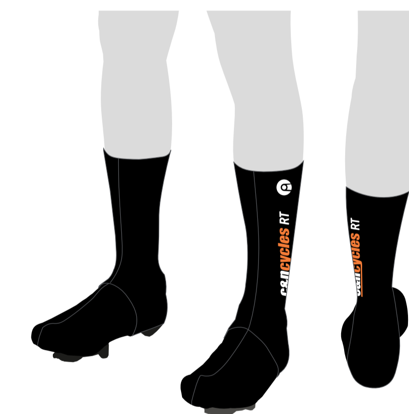
HYPERSONIC OVERSHOES UCI