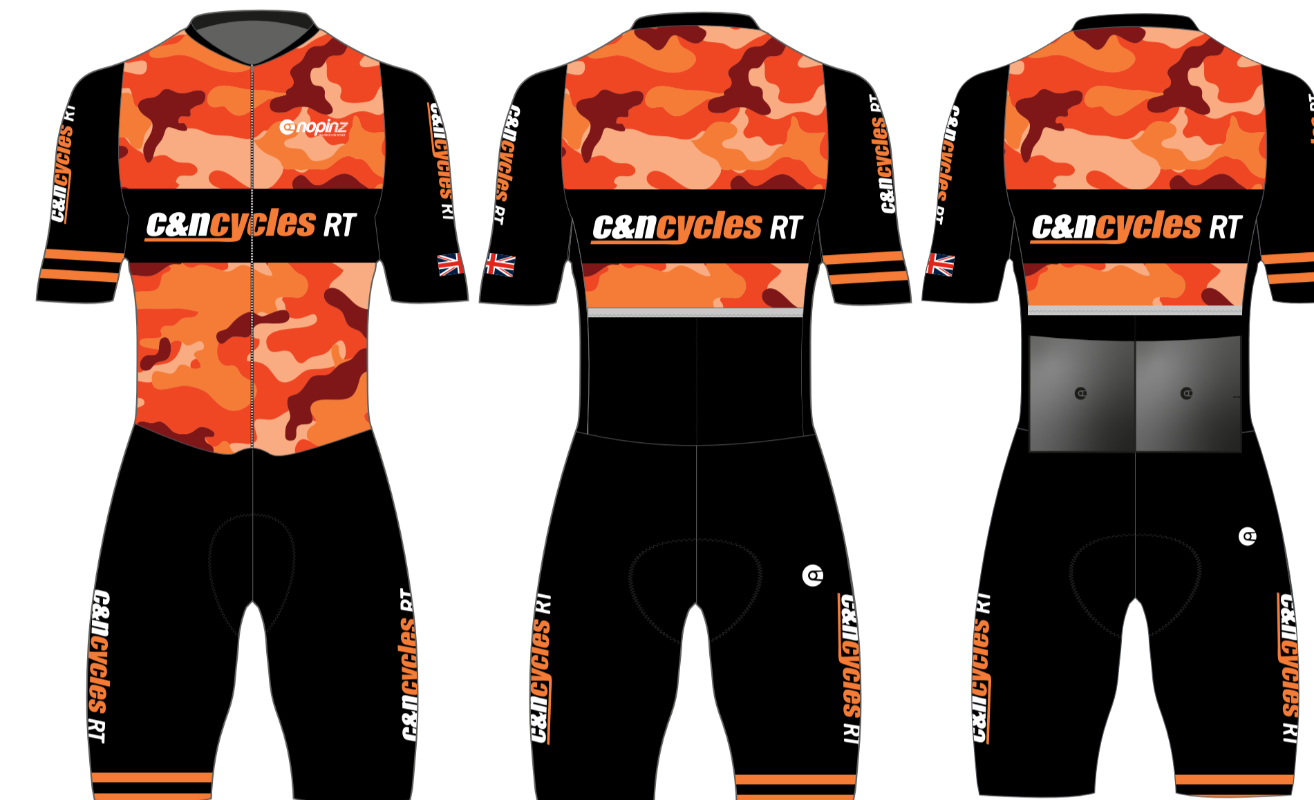
PRO-1 EVO RR SUIT