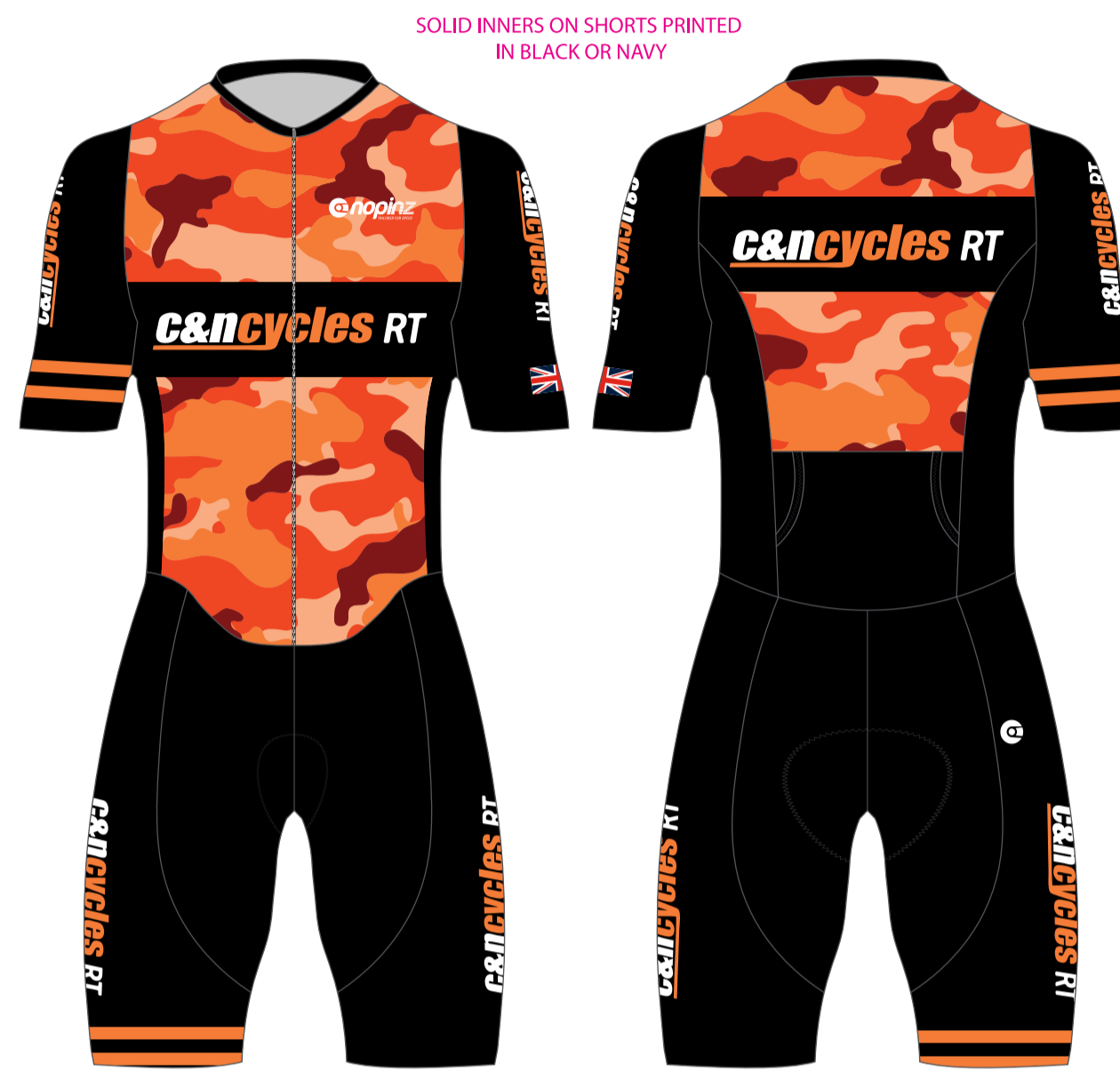
PRO 1 EVO SS TRI SUIT