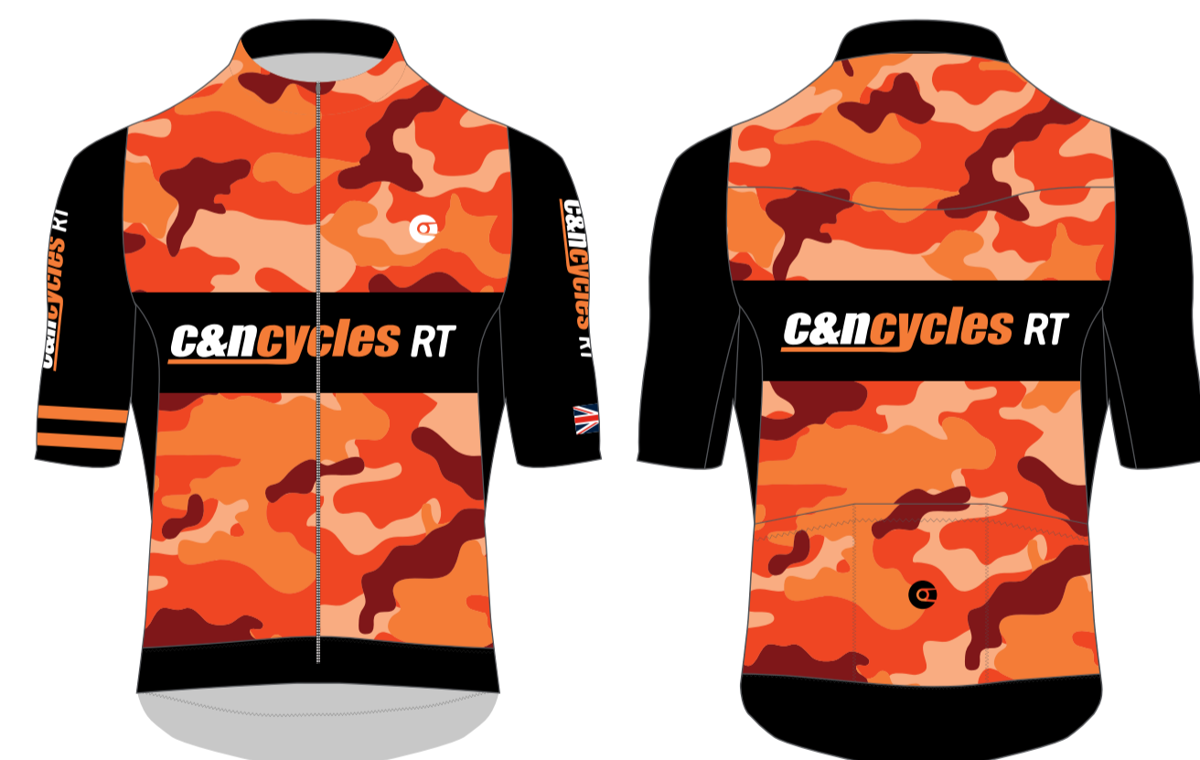
PRO-1 EVO MAX JERSEY