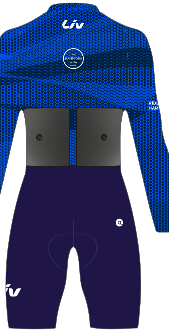
TRACK POCKET DESIGN