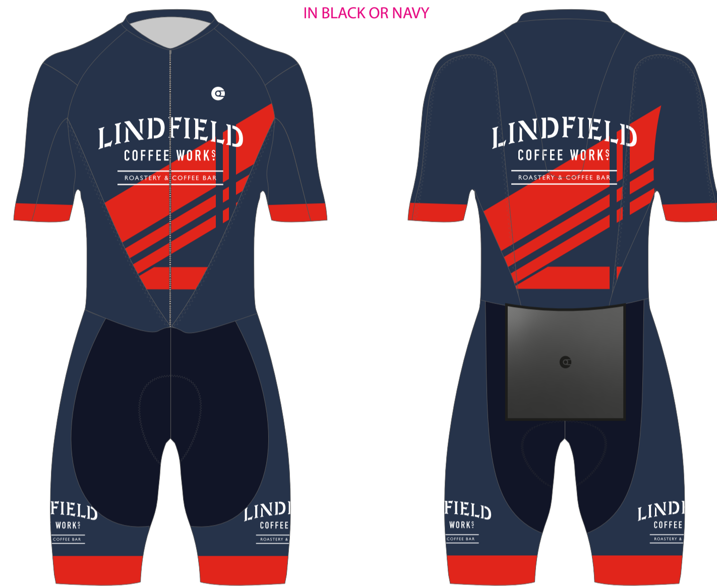
FLOW SUBZERO SUIT

SOLID INNERS ON SHORTS PRINTED IN BLACK OR NAVY