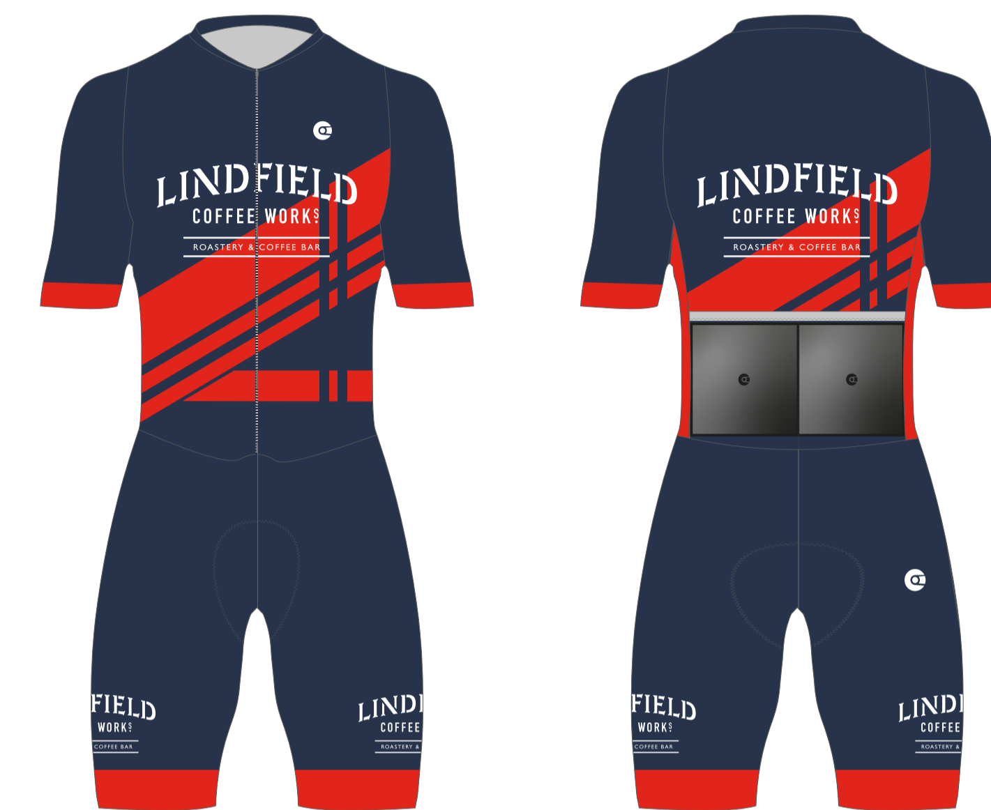
PRO1 ROAD RACE SUIT

DIFFERENCE IN COLOUR MAY OCCUR ON GILET DUE TO MATERIAL COMPOSITION