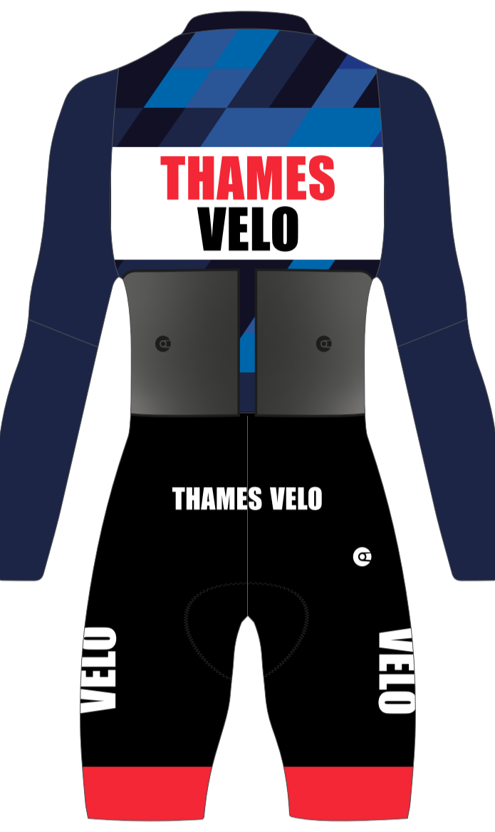
TRACK POCKET DESIGN