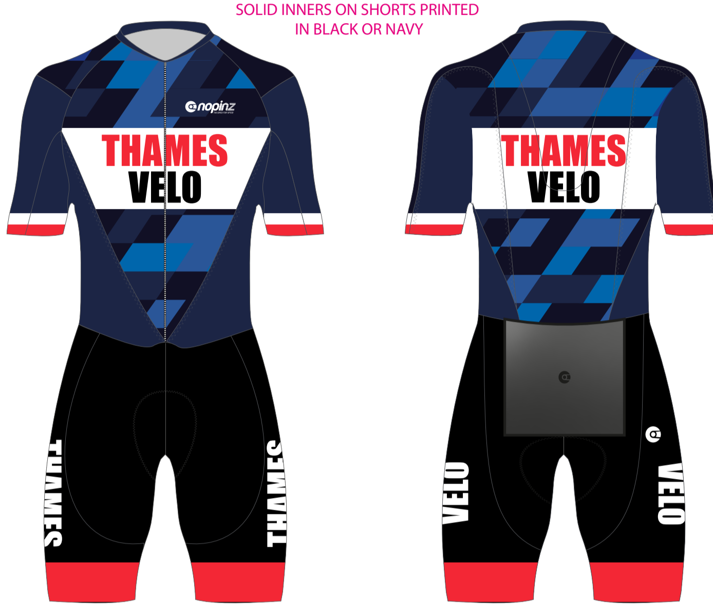
FLOW SUBZERO SUIT