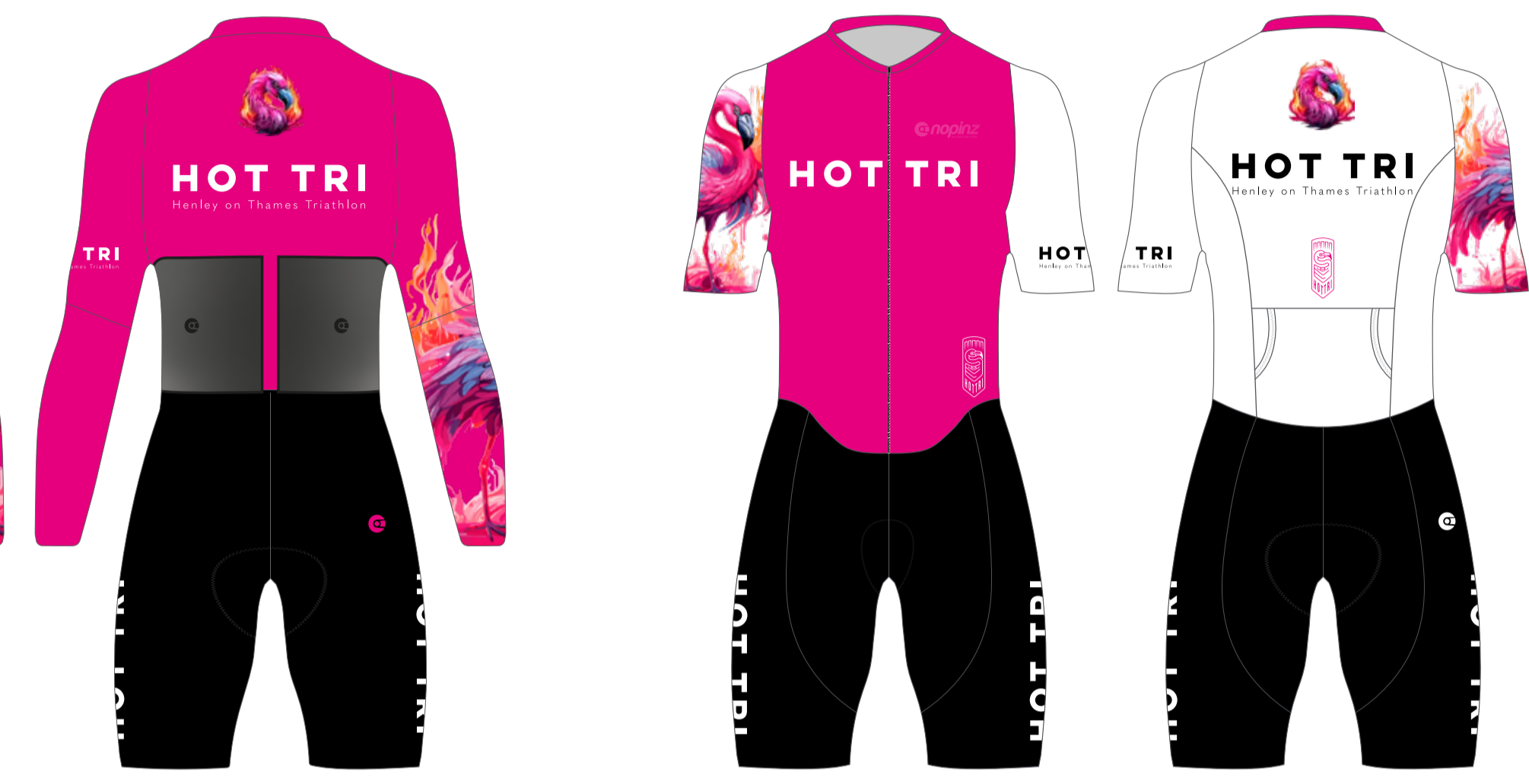
TRACK POCKET DESIGN