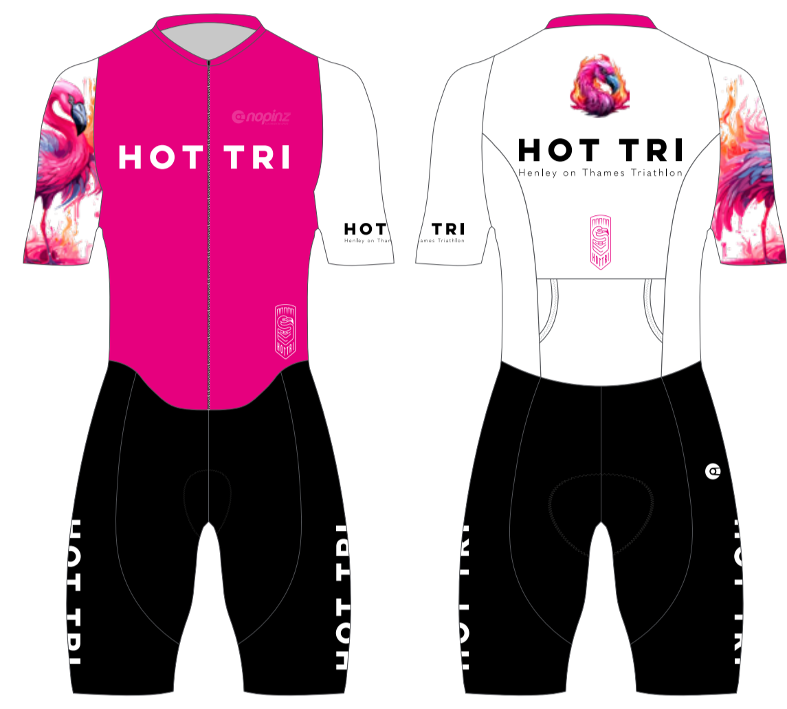
PRO1 TRIATHLON SUIT