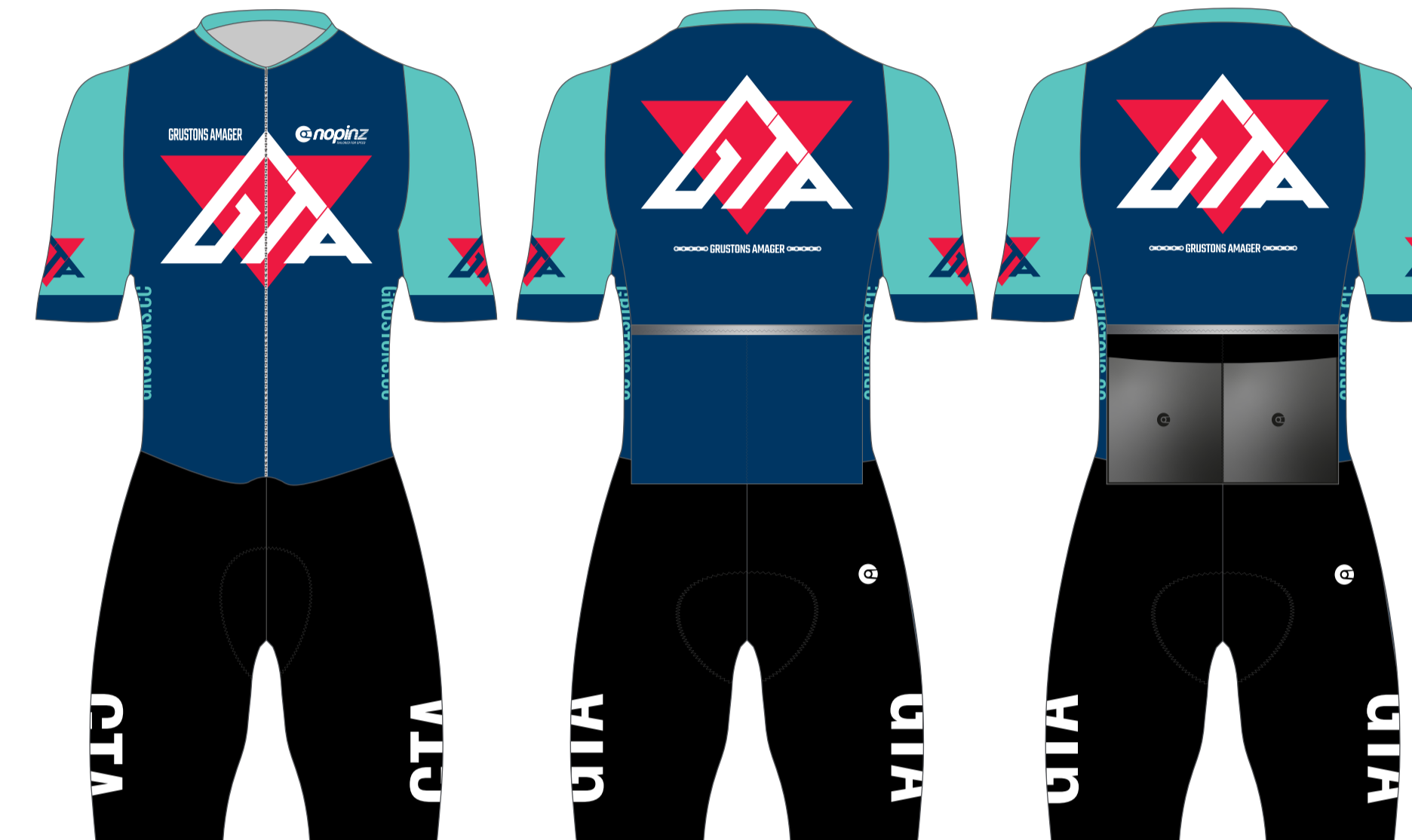
PRO-1 ROAD SKINSUIT