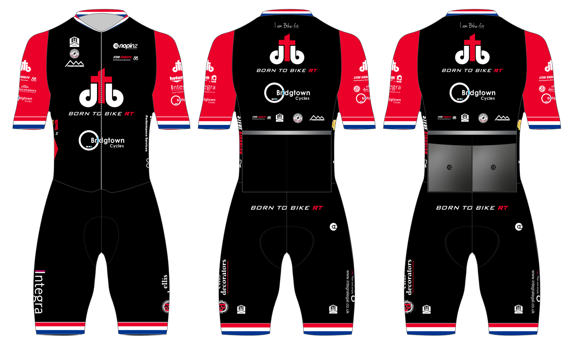
PRO-1 ROAD SKINSUIT