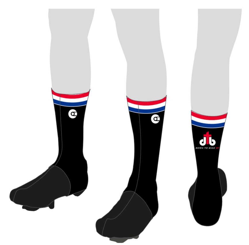
HYPERSONIC OVERSHOES UCI