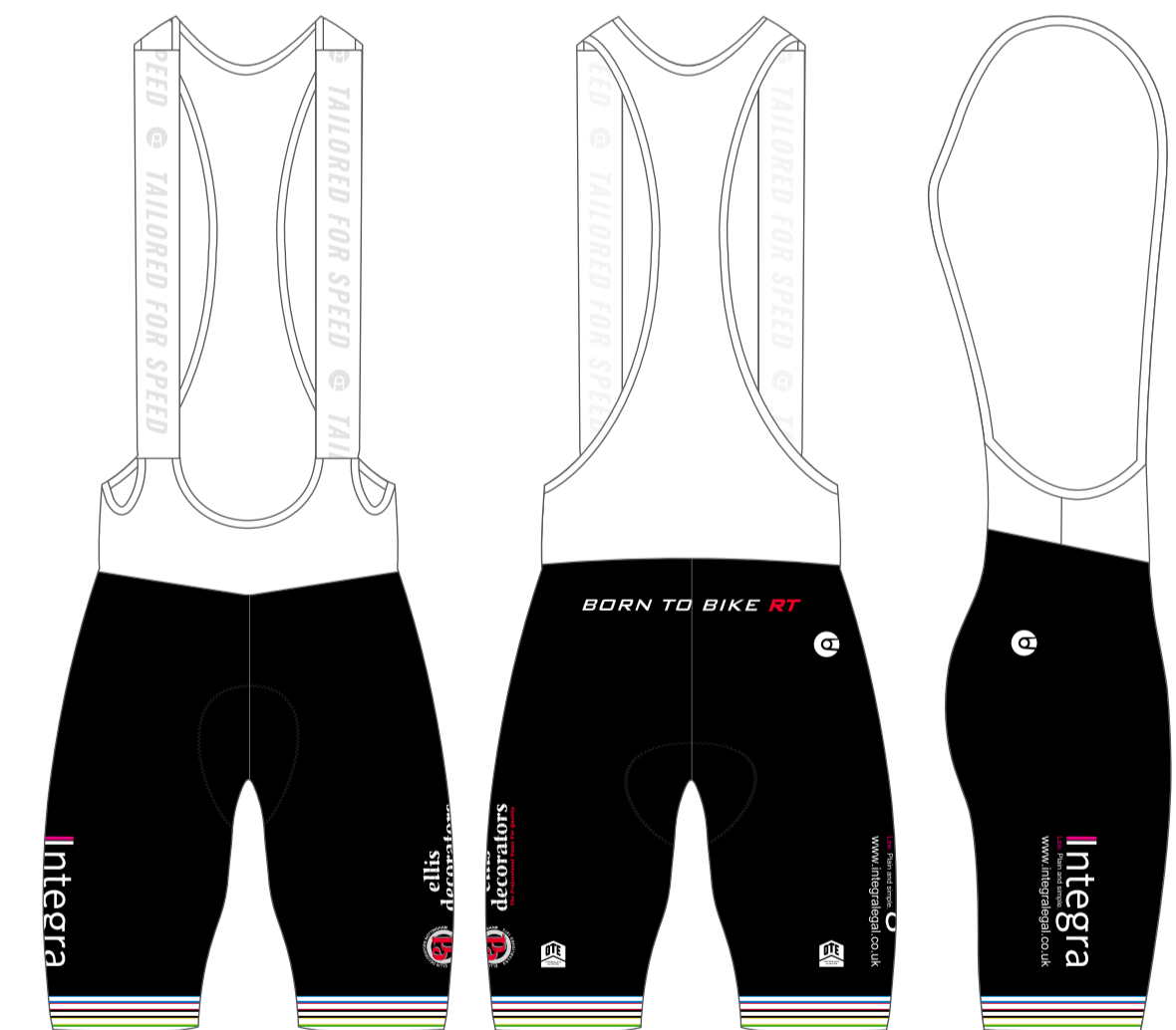
PRO-1 BIB SHORTS