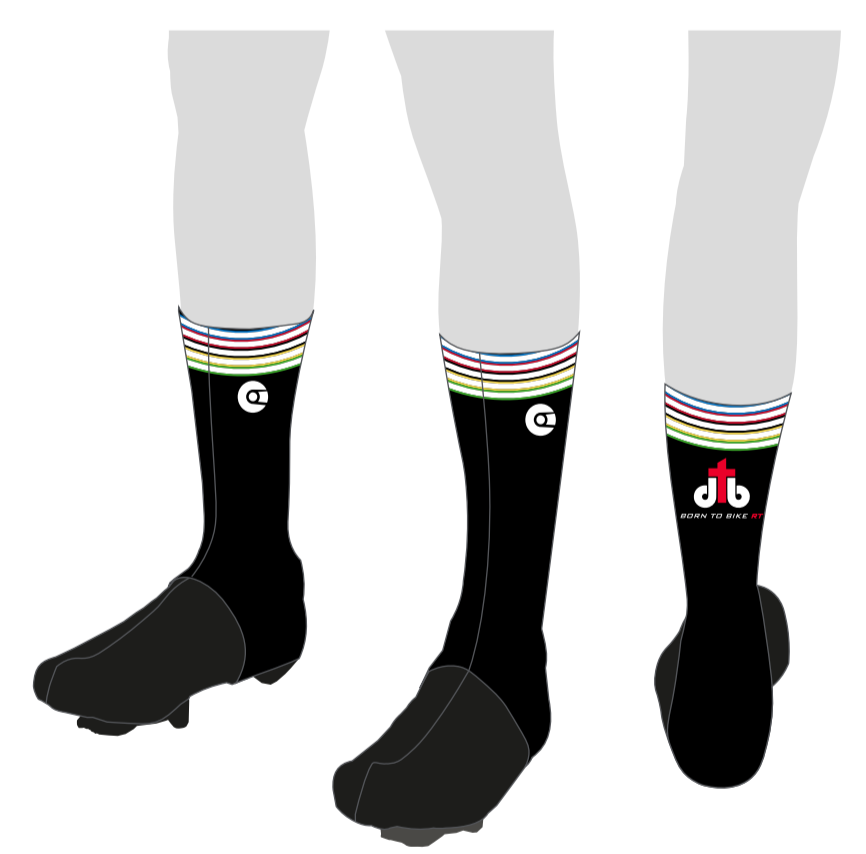
HYPERSONIC OVERSHOES UCI