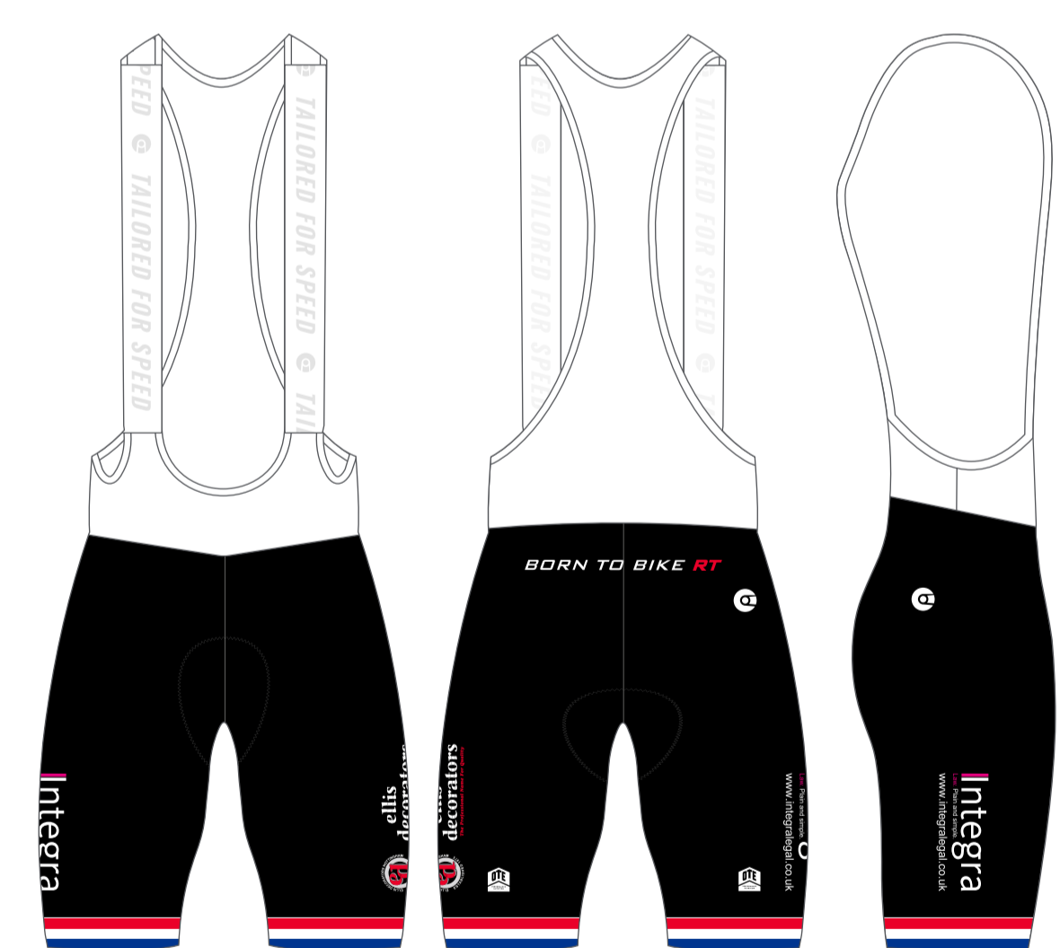
PRO-1 BIB SHORTS