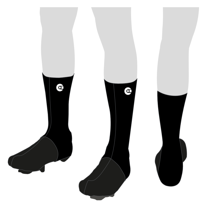
HYPERSONIC OVERSHOES UCI