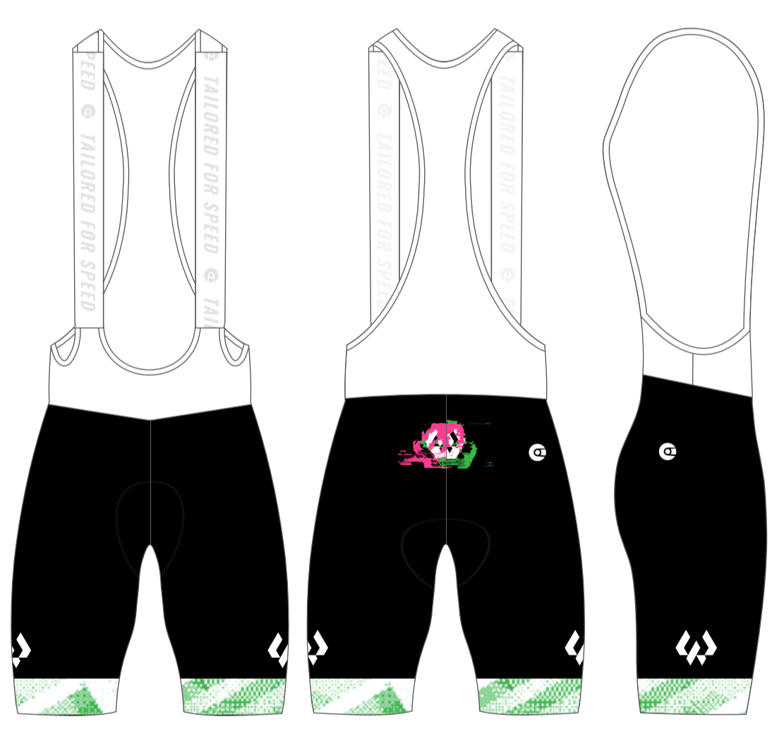
PRO-1 BIB SHORTS