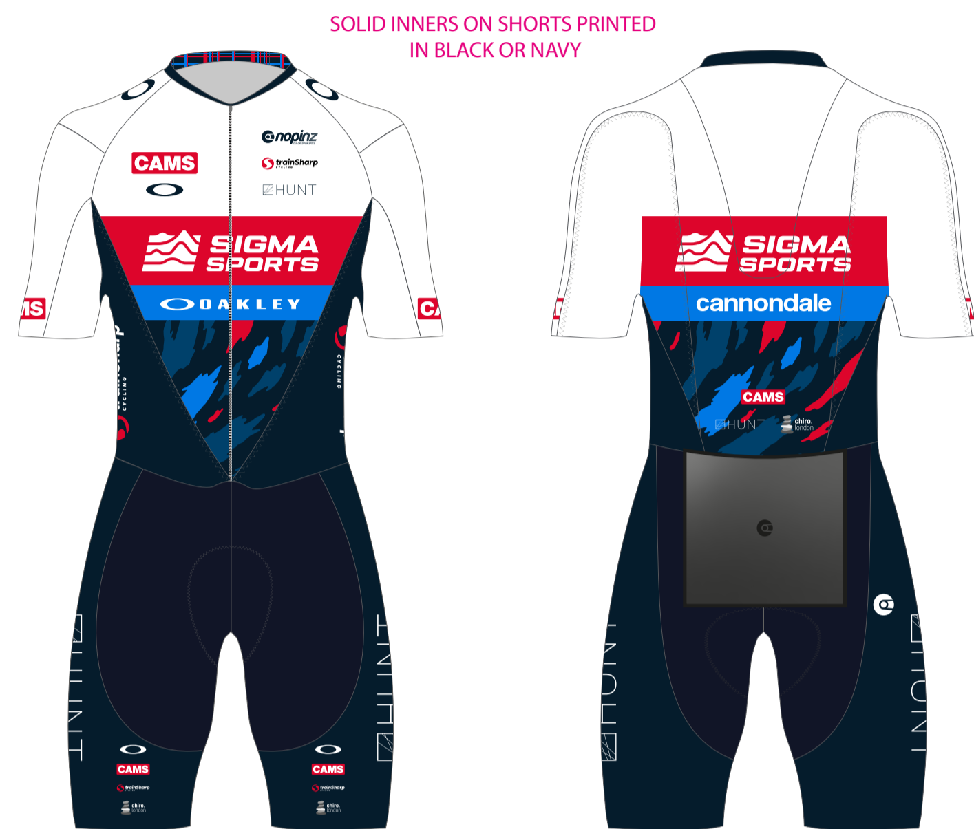
FLOW SUBZERO SUIT