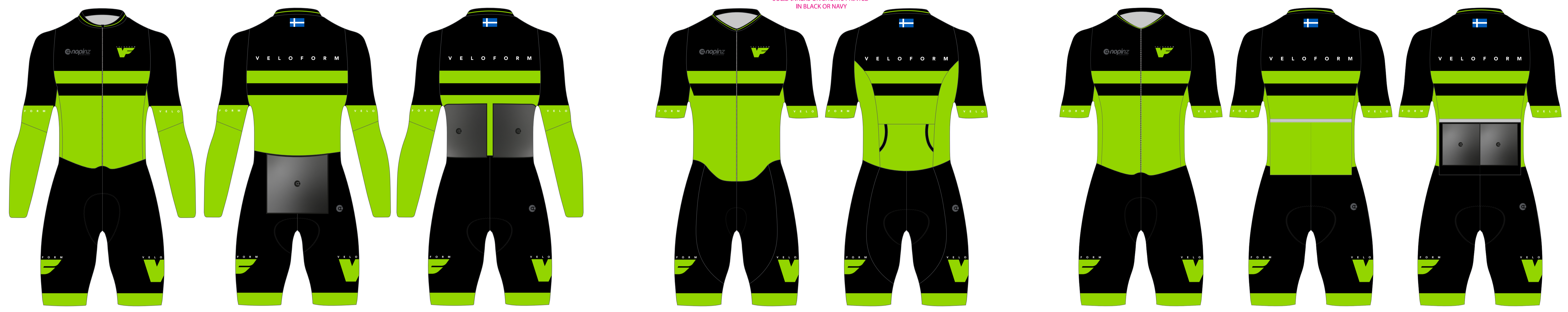
PRO-1 SPEEDSUIT TRACK POCKET DESIGN PRO-1 TRISUIT PRO-1 ROAD SKINSUIT SPEED POCKET DESIGN