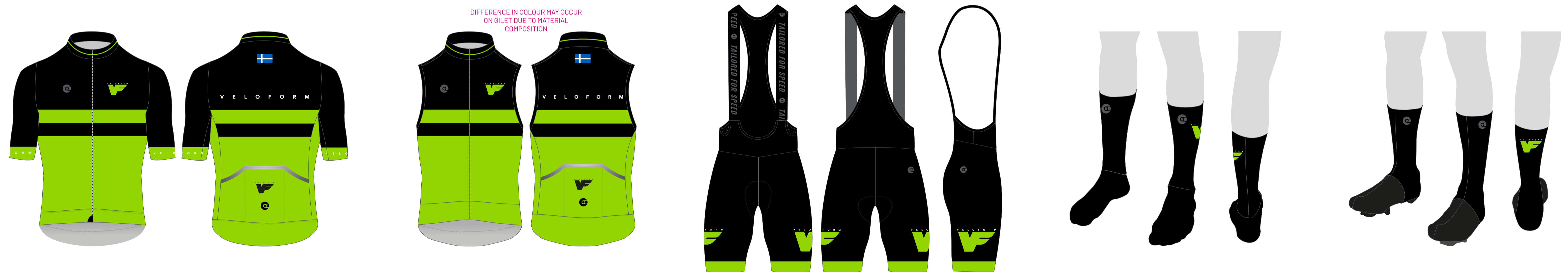
PRO-1 JERSEY PRO-1 GILET PRO-1 BIB SHORTS PRO-1 SOCKS HYPERSONIC OVERSHOES UCI