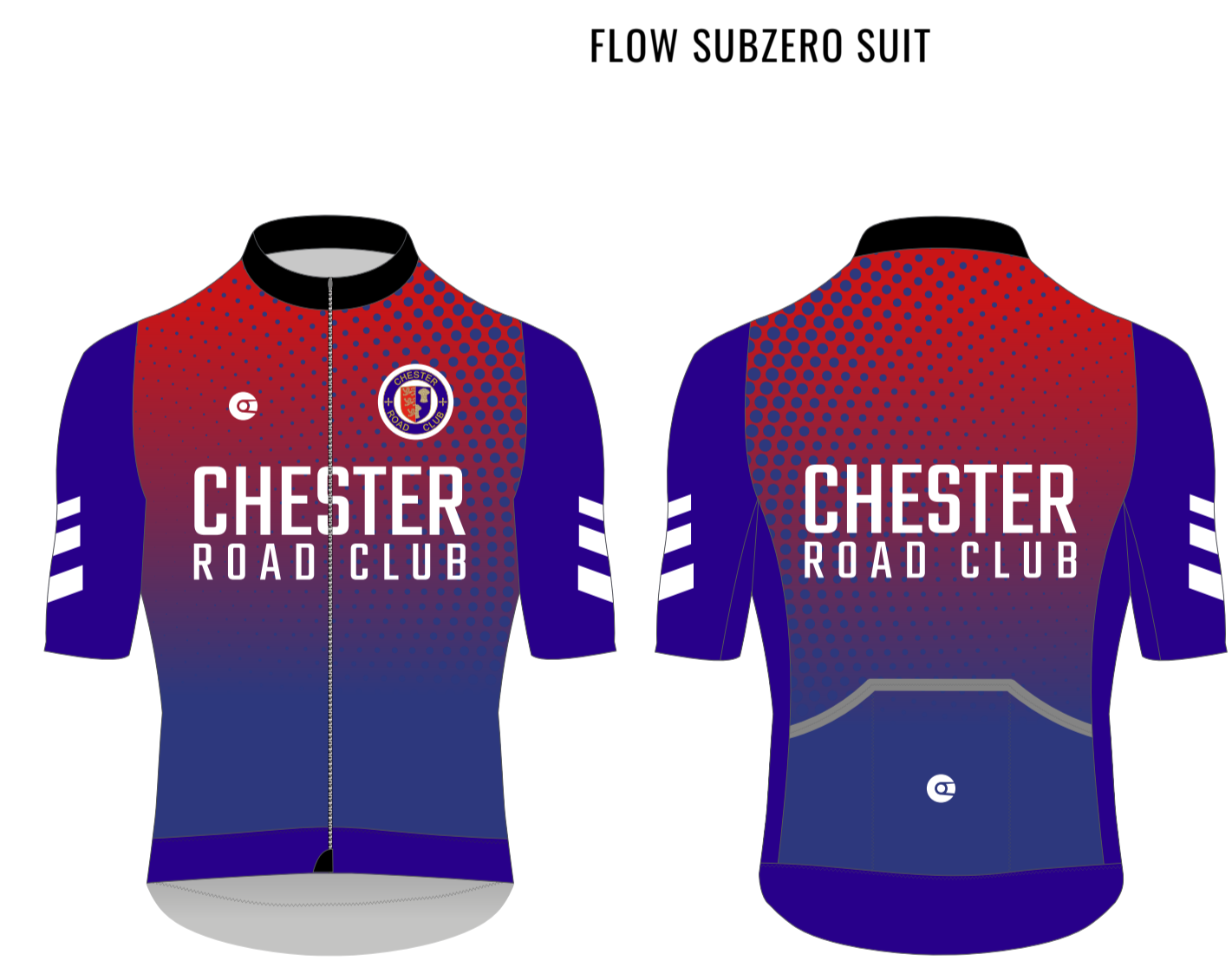
FLOW SUBZERO SUIT