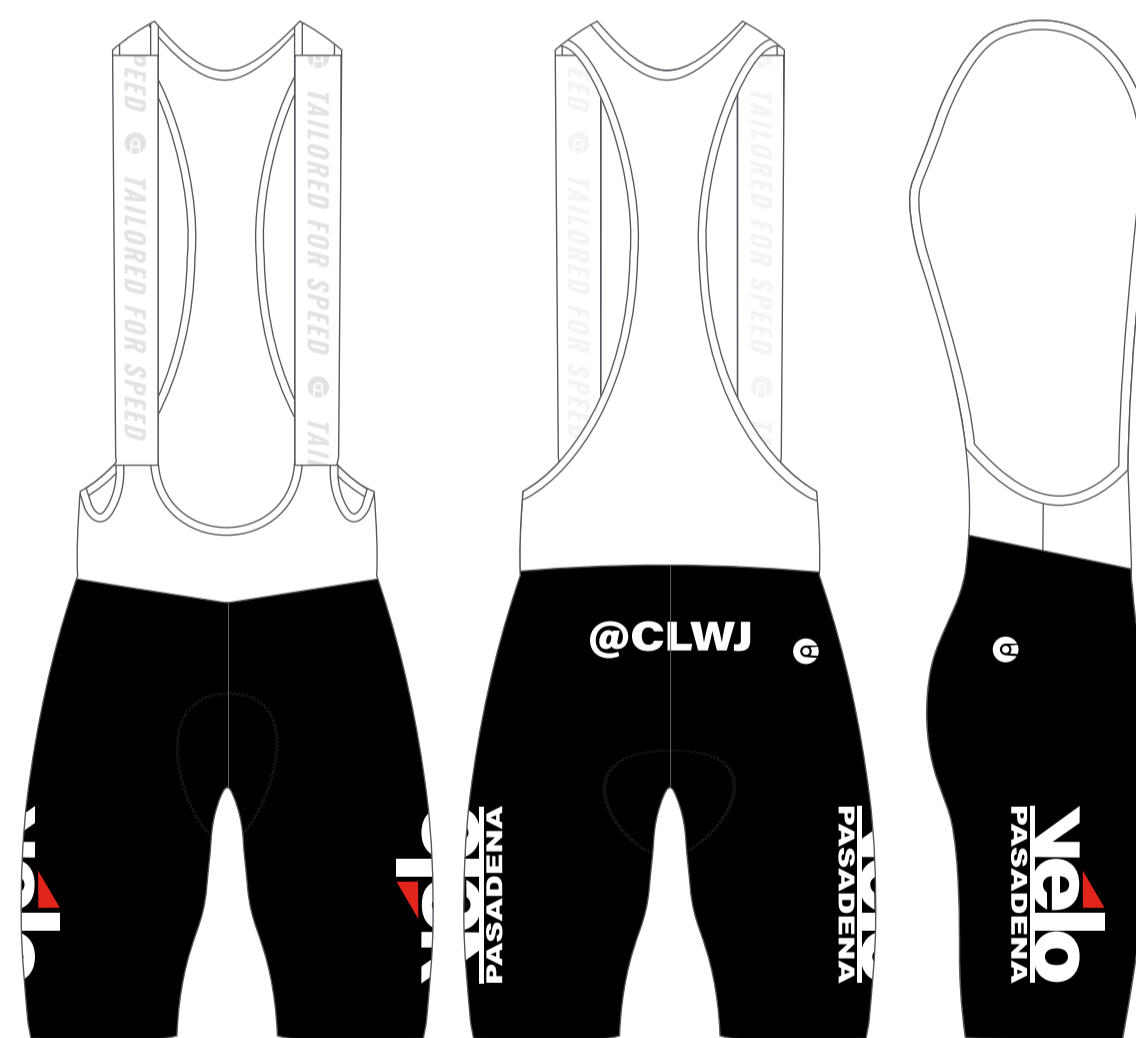
PRO-1 BIB SHORTS