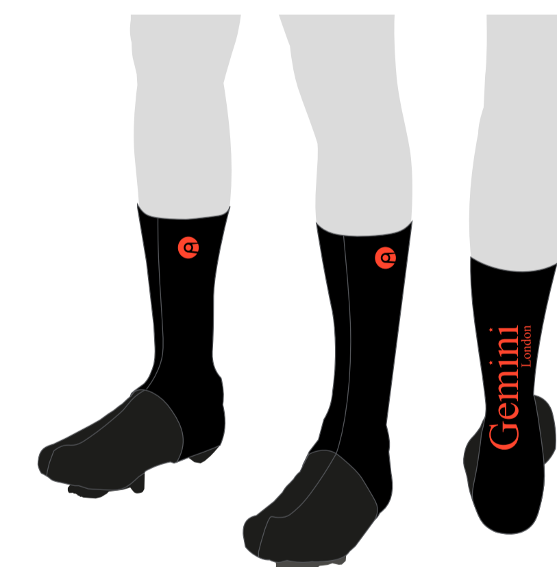
HYPERSONIC OVERSHOES UCI