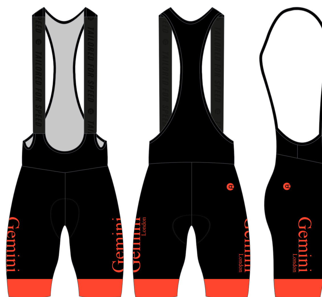
PRO-1 BIB SHORTS