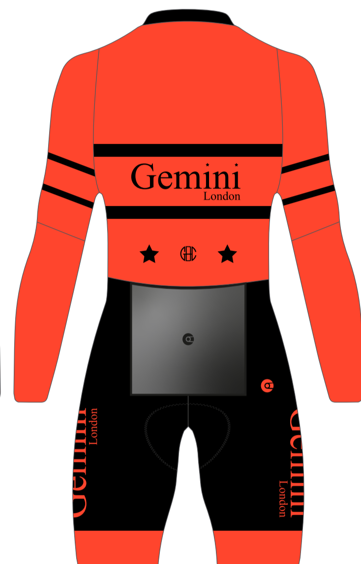
TRACK POCKET DESIGN