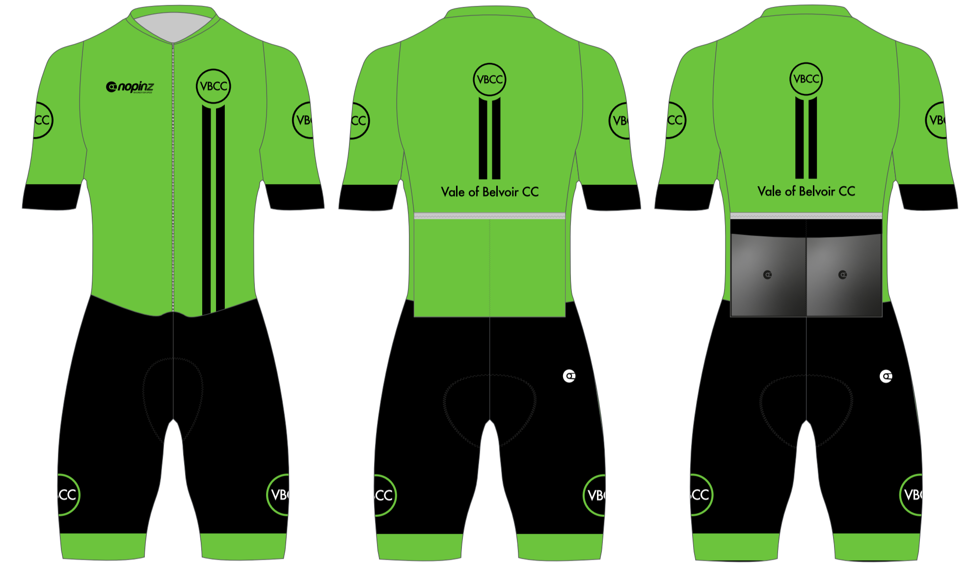
PRO-1 ROAD SKINSUIT