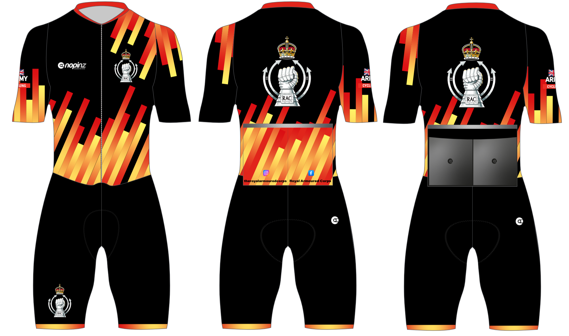
PRO-1 ROAD SKINSUIT