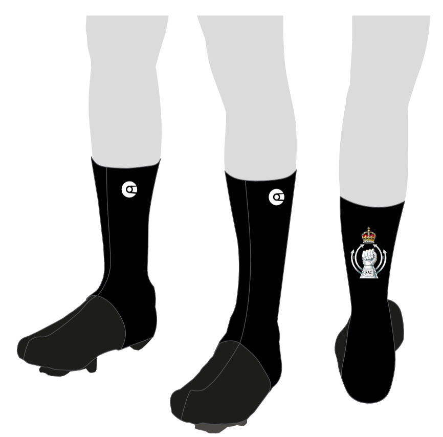
HYPERSONIC OVERSHOES UCI