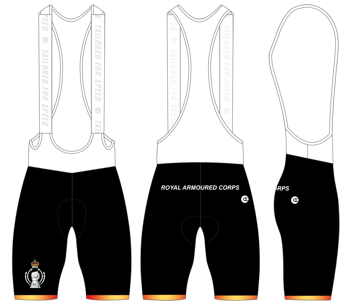
PRO-1 BIB SHORTS