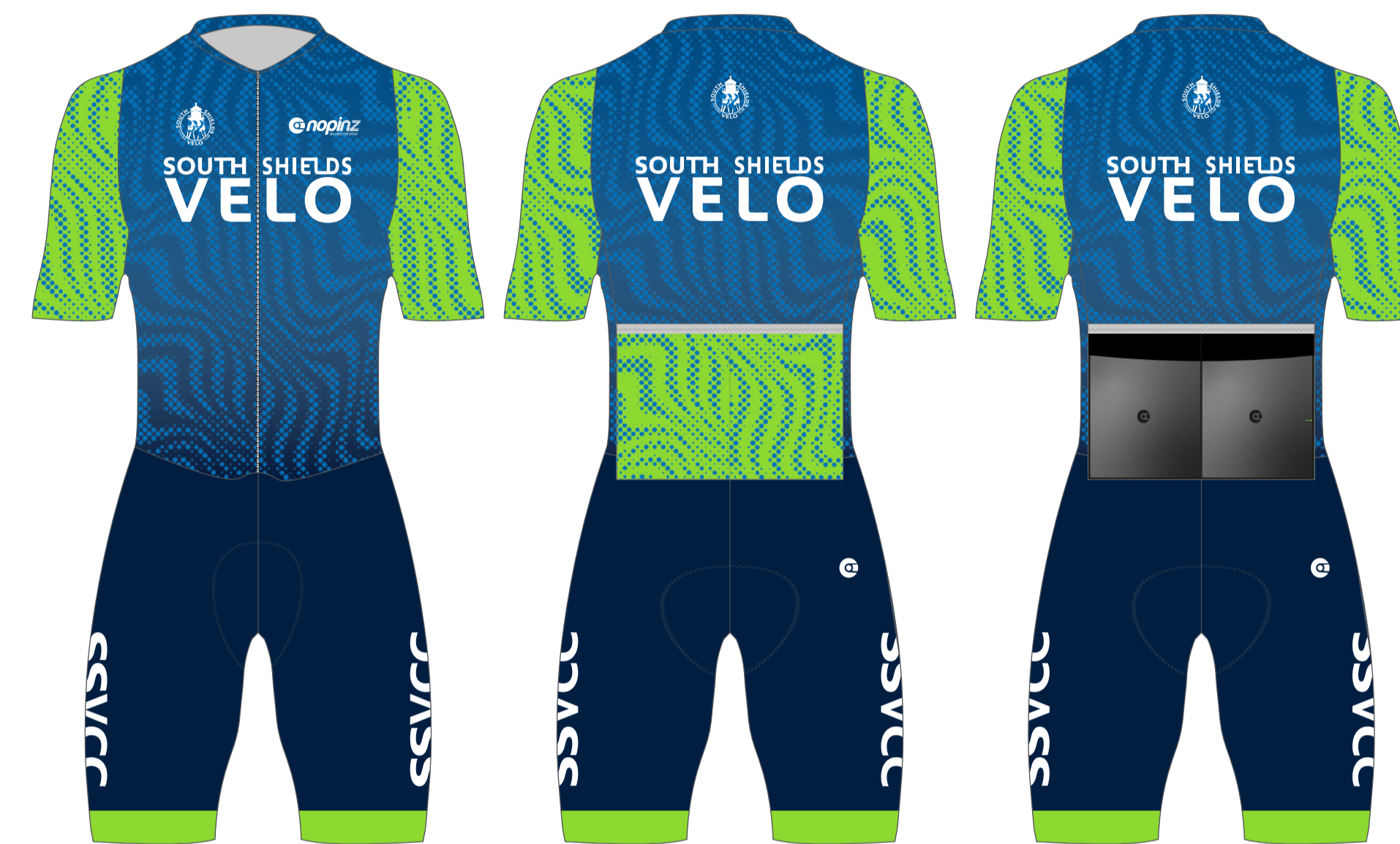
PRO-1 ROAD SKINSUIT