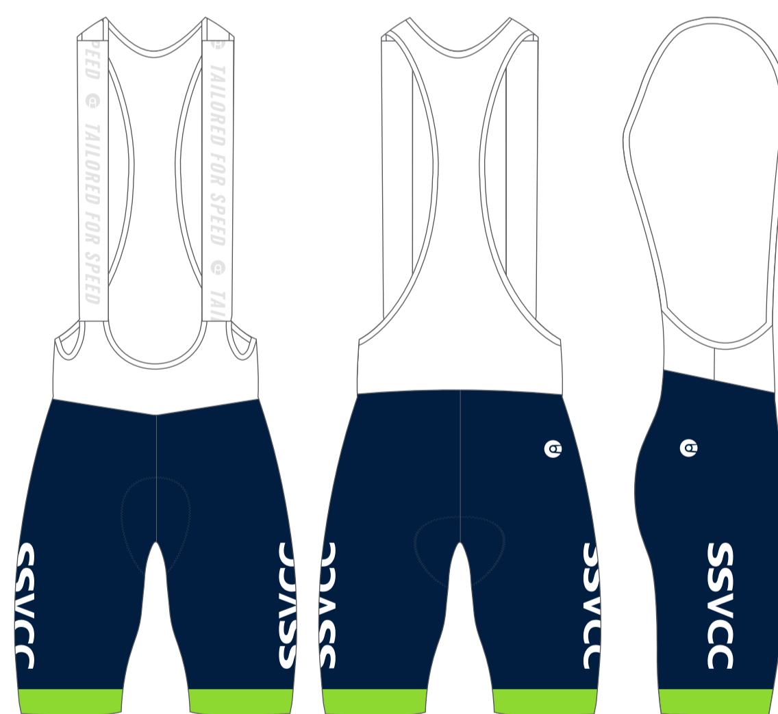
PRO-1 BIB SHORTS