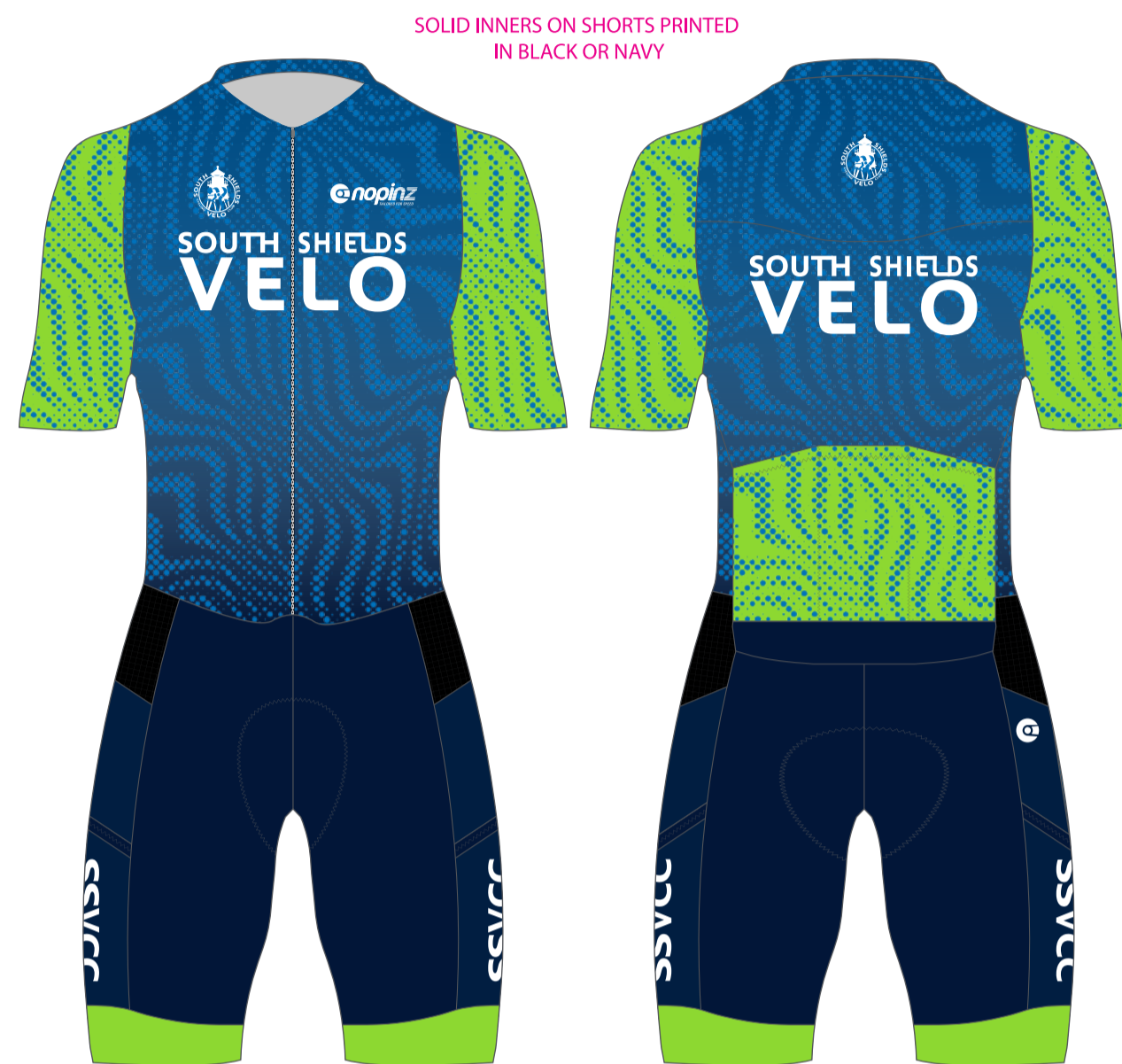
PRO-1 GRAVEL SUIT