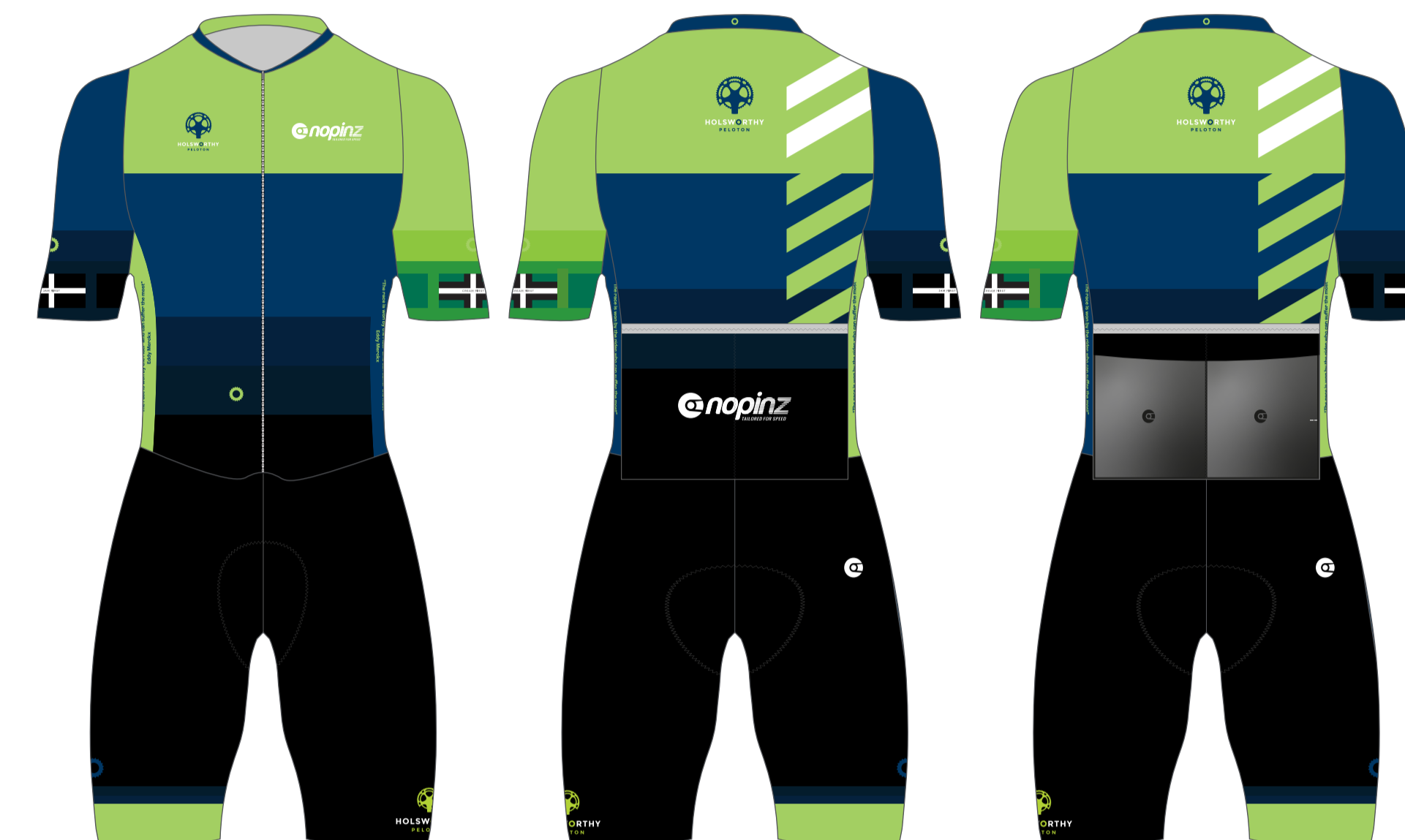
PRO-1 ROAD SKINSUIT