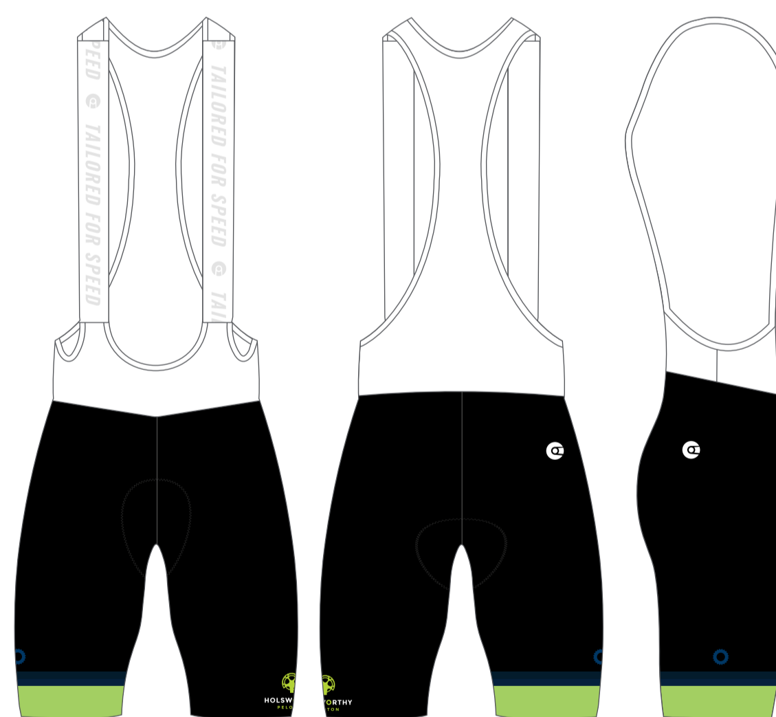
PRO-1 BIB SHORTS