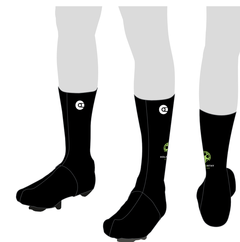
HYPERSONIC OVERSHOES UCI