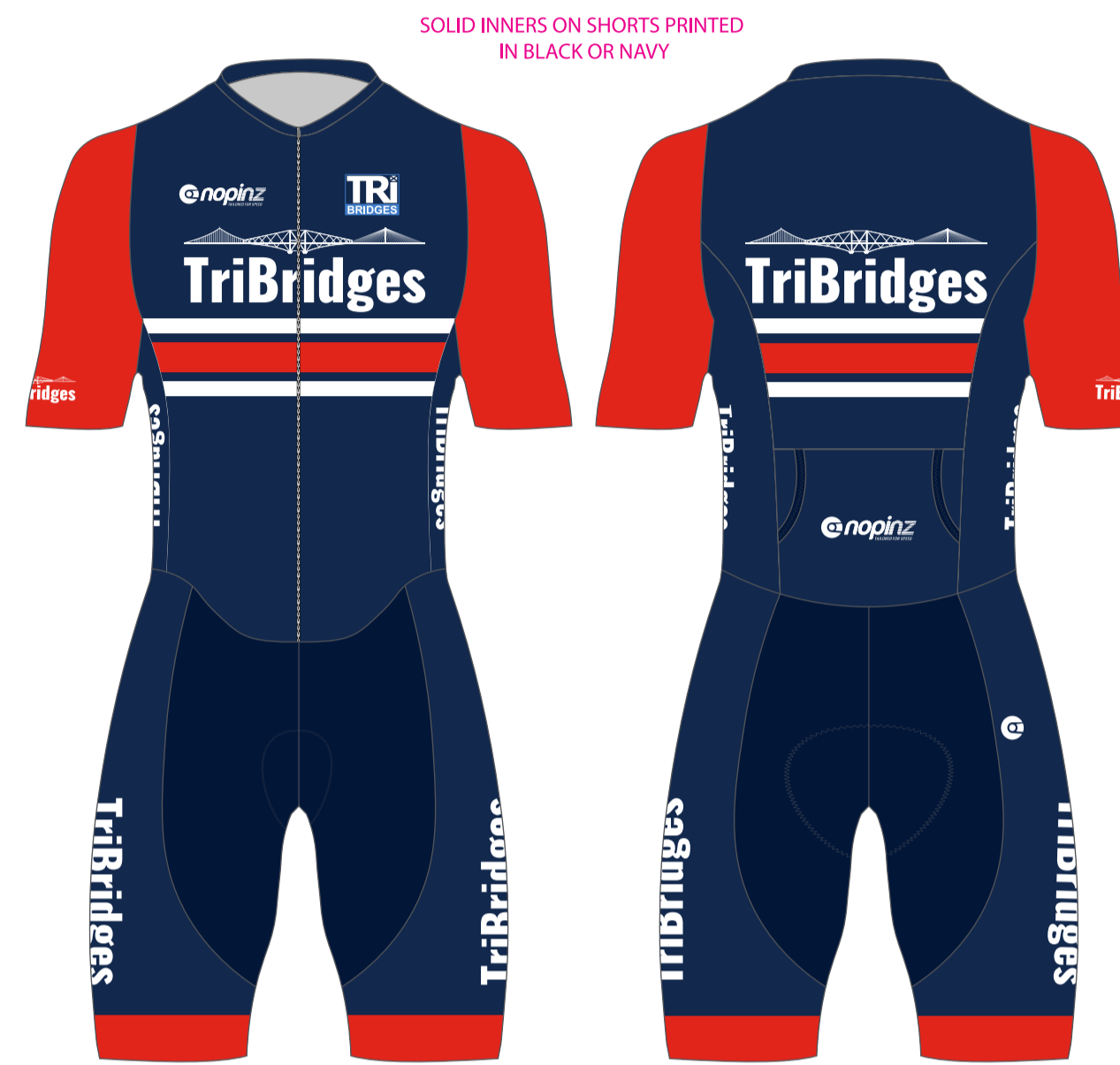
PRO 1 EVO SS TRI SUIT