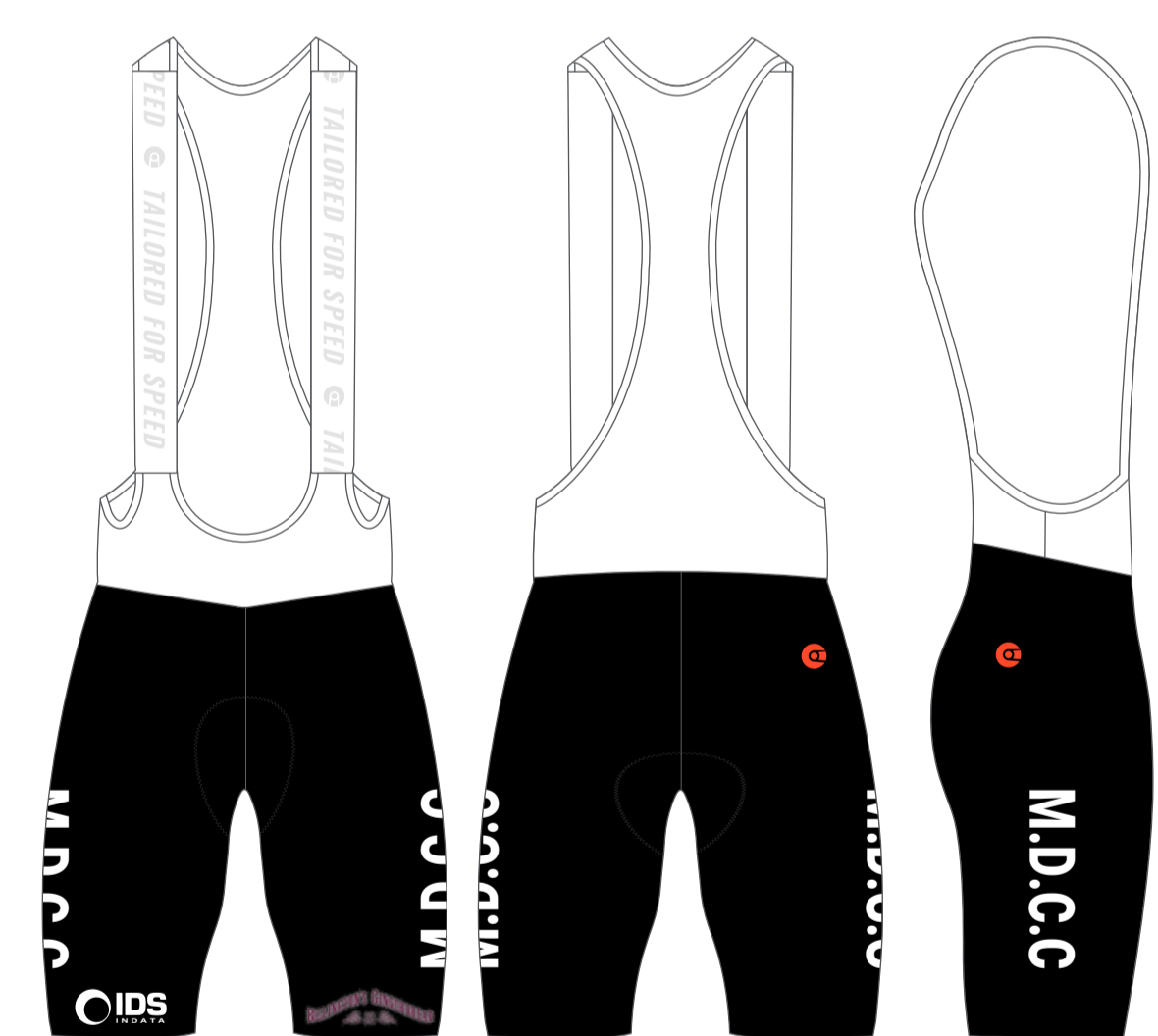
PRO-1 EVO BIB SHORTS

DIFFERENCE IN COLOUR MAY OCCUR ON GILET DUE TO MATERIAL COMPOSITION