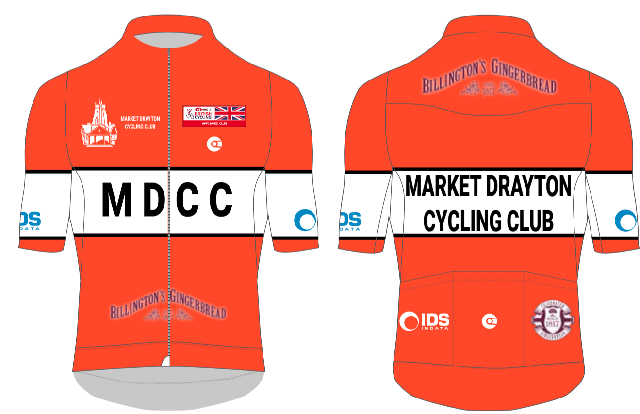
PRO-1 EVO MAX JERSEY