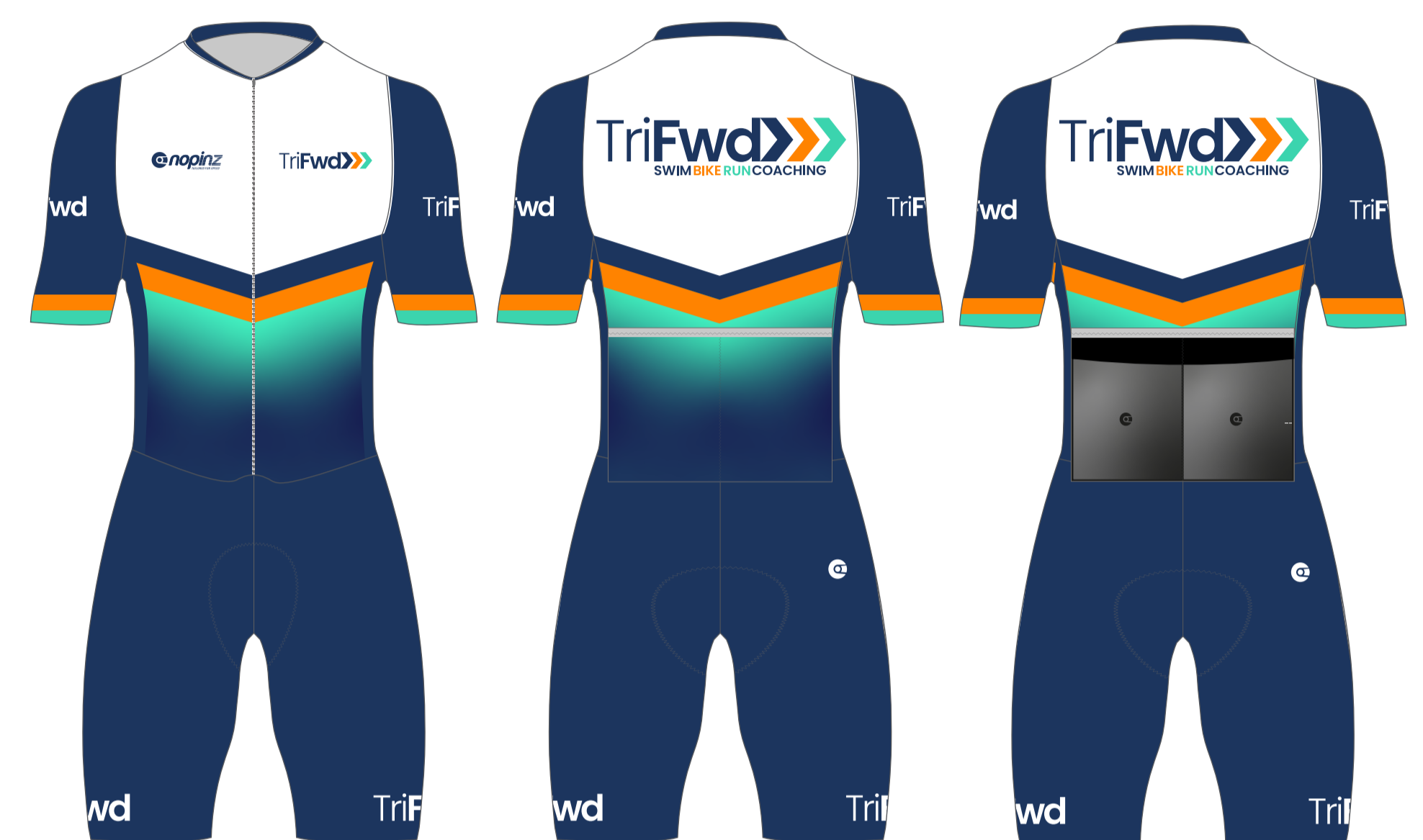
PRO-1 EVO RR SUIT