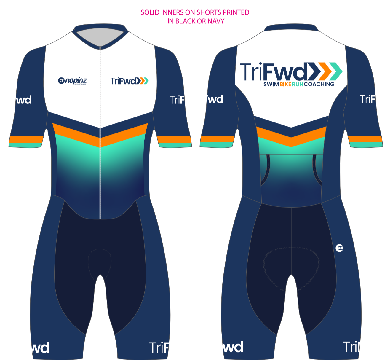
PRO 1 EVO SS TRI SUIT