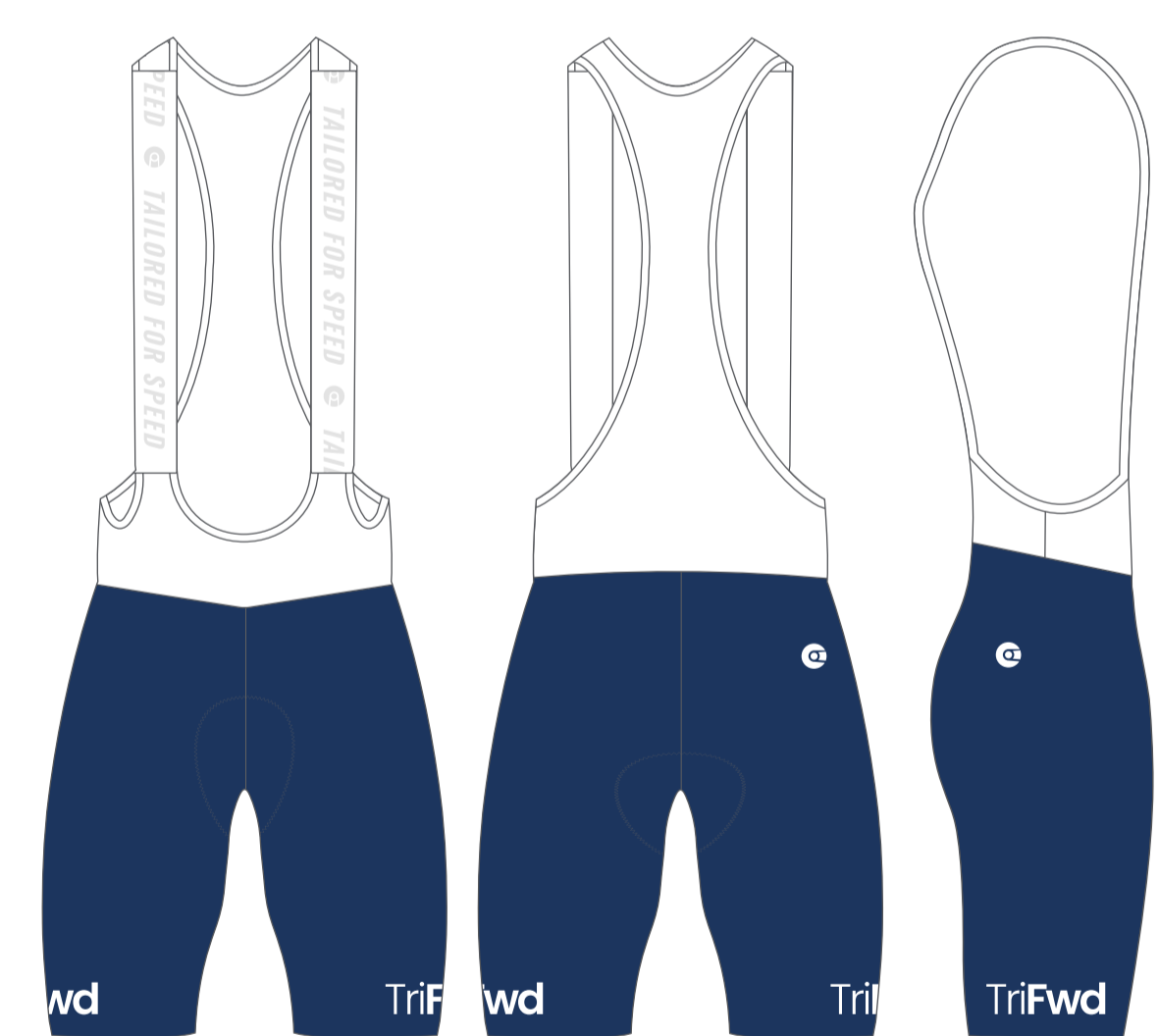
PRO-1 EVO BIB SHORTS