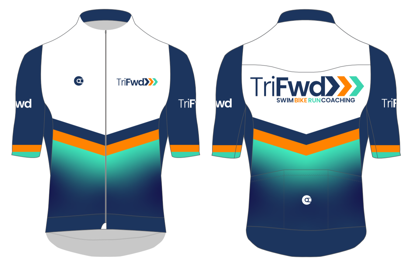
PRO-1 EVO MAX JERSEY