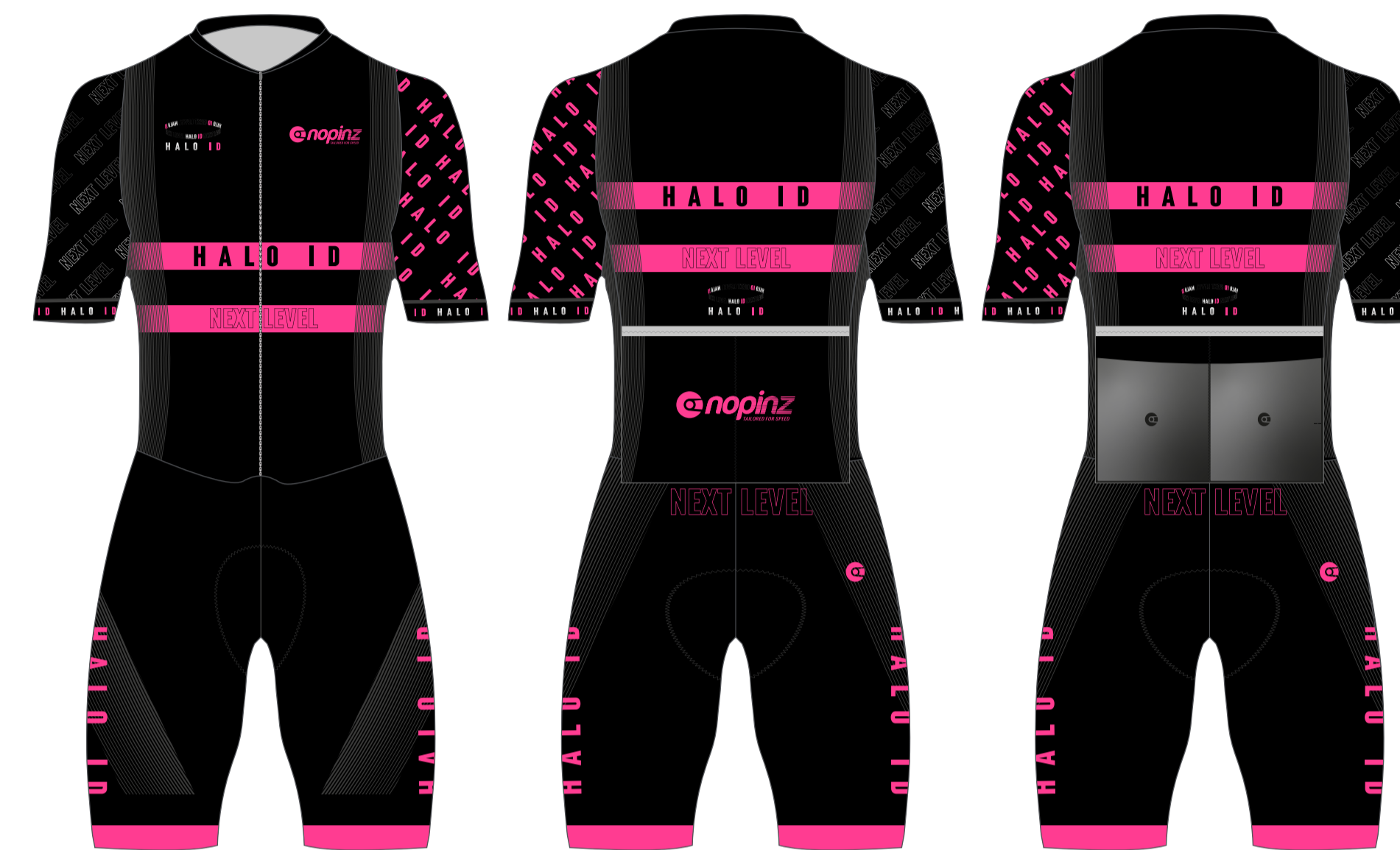
PRO-1 ROAD SKINSUIT