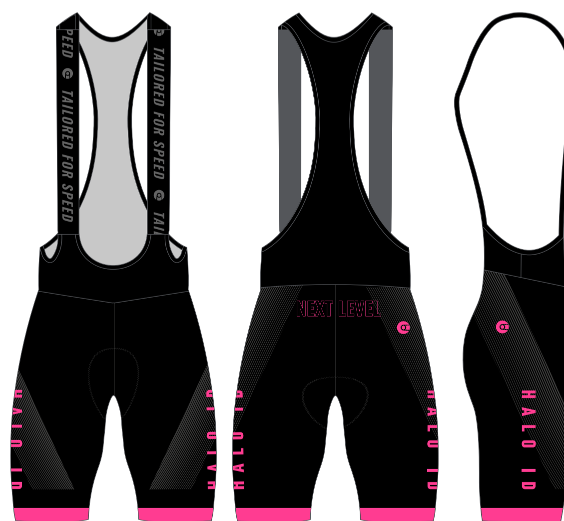
PRO-1 BIB SHORTS