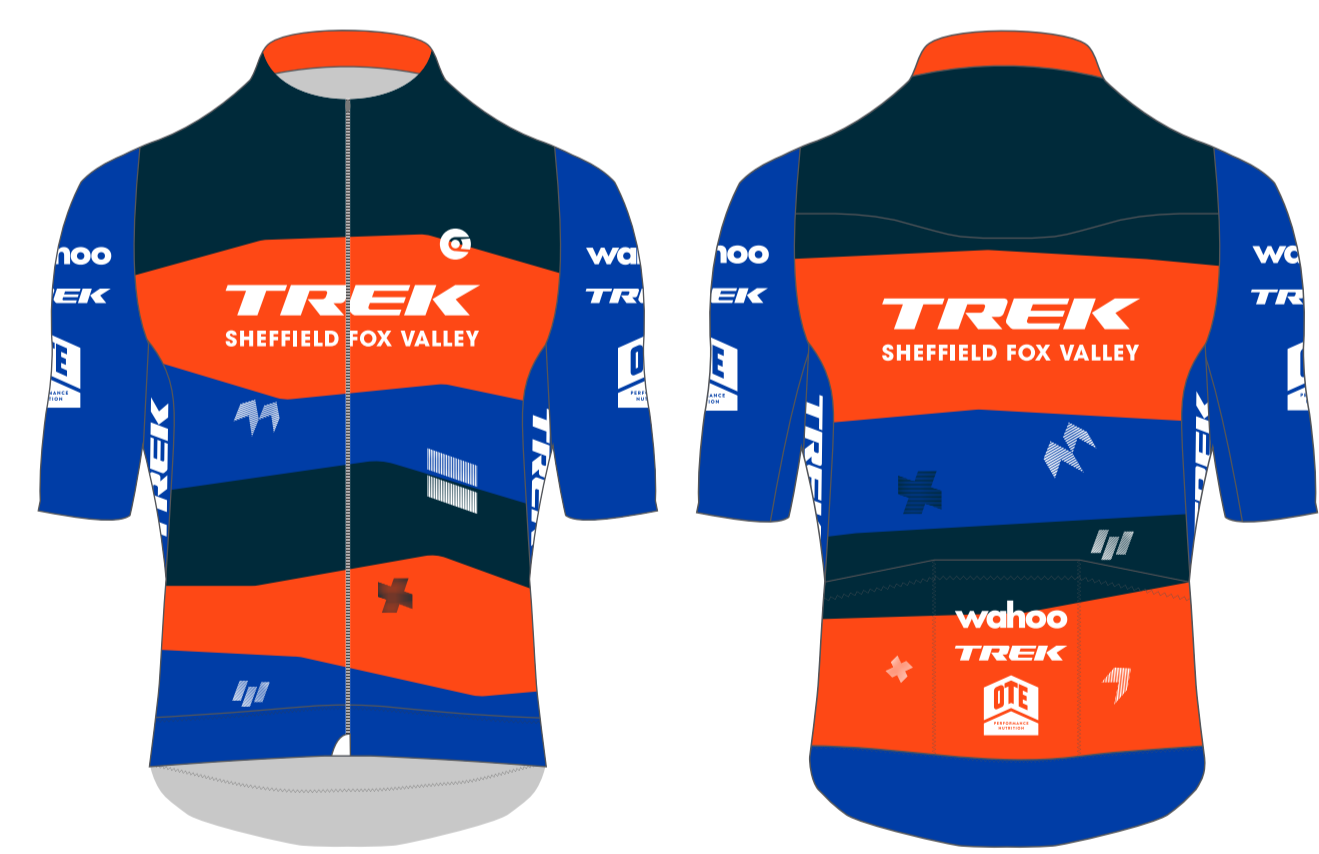
PRO-1 EVO MAX JERSEY