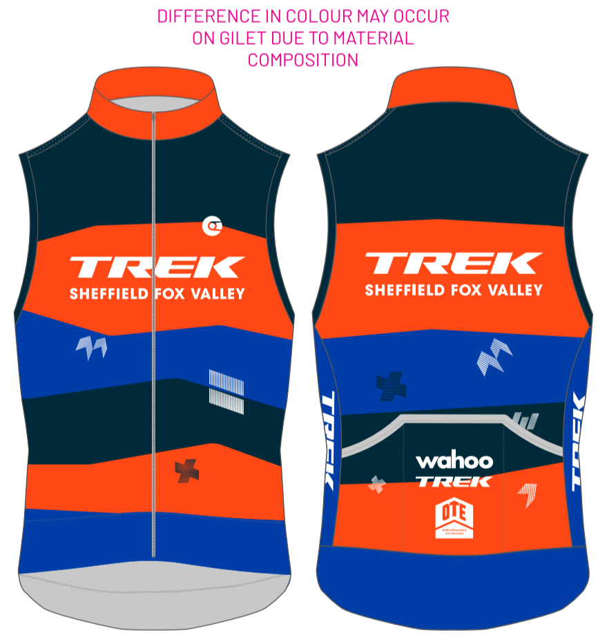
PRO-1 EVO GILET