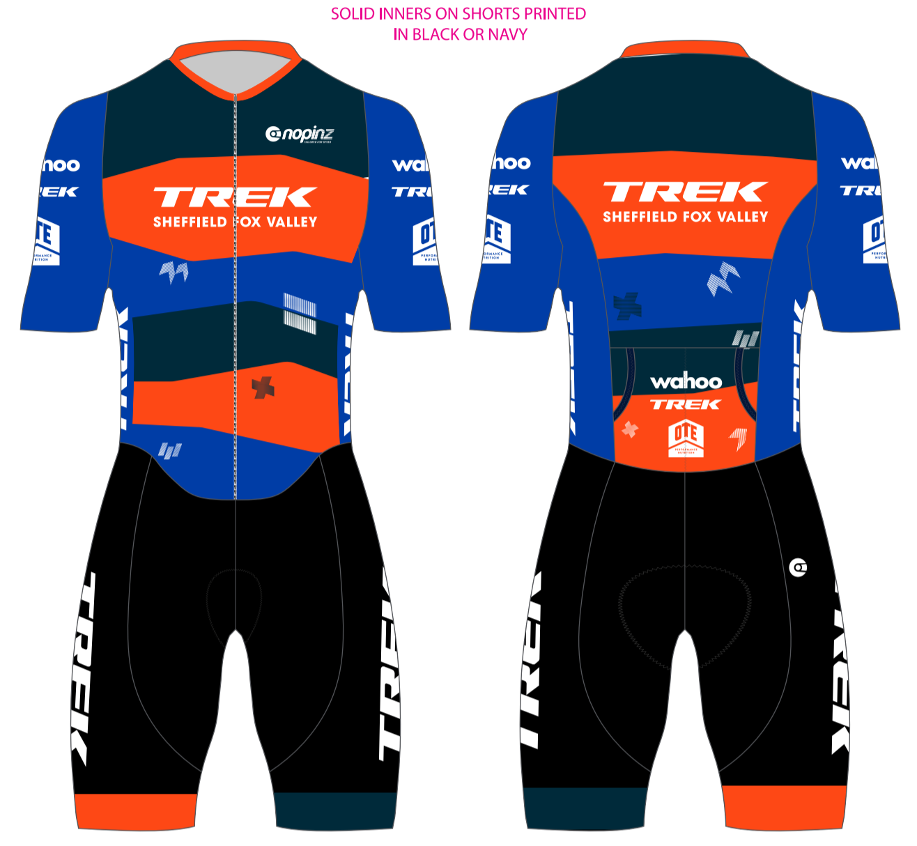
PRO 1 EVO SS TRI SUIT