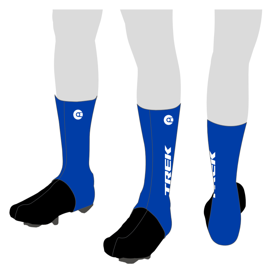
HYPERSONIC OVERSHOES UCI