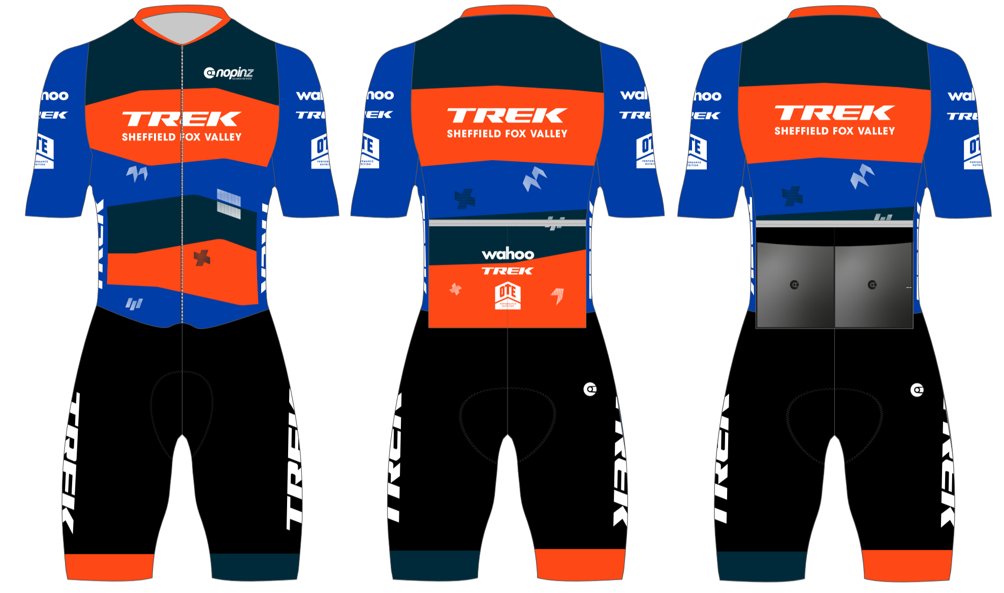
PRO-1 EVO RR SUIT