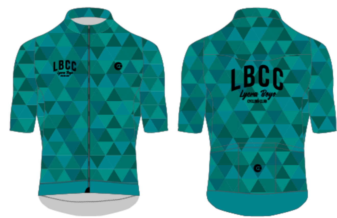
PRO-1 EVO MAX JERSEY