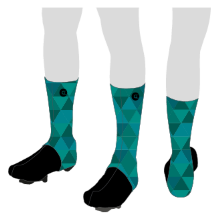
HYPERSONIC OVERSHOES UCI

SEWING STITCH COLOUR: UPPER - BLACK LOWER - BLACK TOP STITCH COLOUR: POCKET -000 GRIPPER - 000 CHAMOIS - 000 SOCKS/COVERS -000 PRO1/ENDURANCE GILET - 000 ZIP COLOUR: BLACK ZIP GUARD COLOUR: BLACK BINDING COLOUR: WHITE TRI&GRAVEL POCKET BINDING: BLACK POCKET BINDING COLOUR: REFLECTIVE SILVER SOLID INNERS FOR SHORTS: BLACK