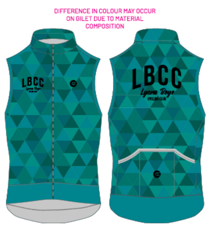
PRO-1 EVO GILET