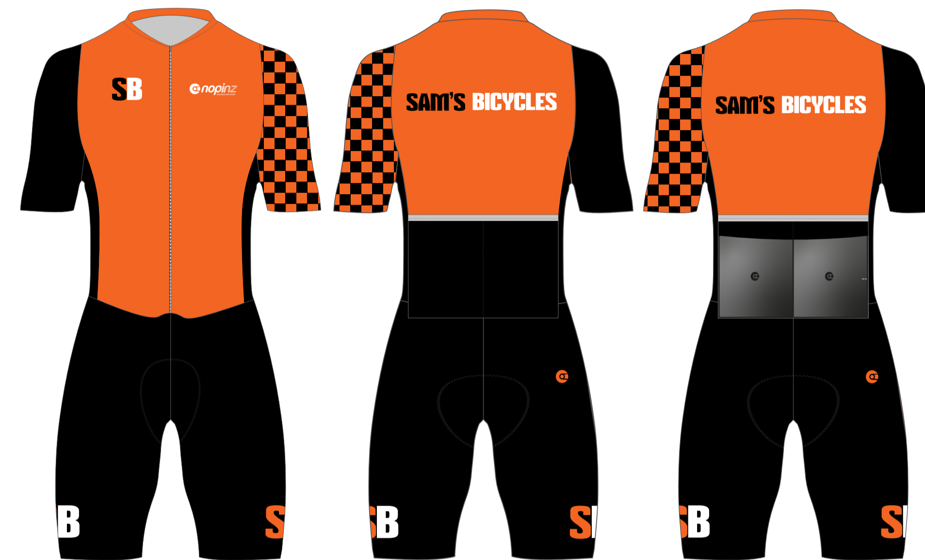
PRO-1 EVO RR SUIT