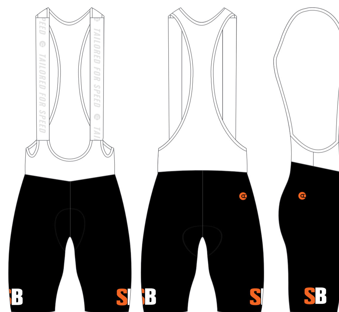
PRO-1 EVO BIB SHORTS