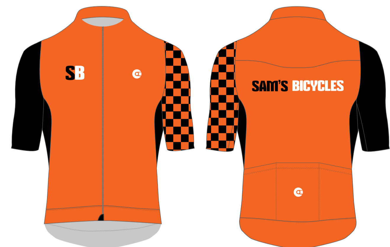
PRO-1 EVO MAX JERSEY