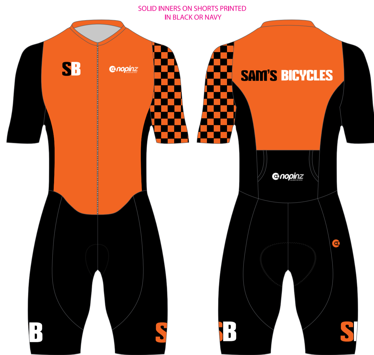
PRO 1 EVO SS TRI SUIT