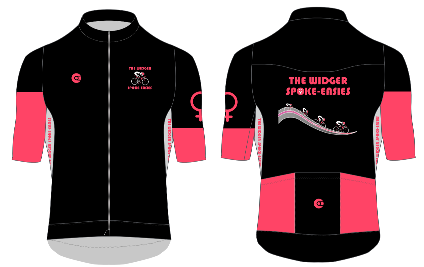
PRO-1 EVO MAX JERSEY