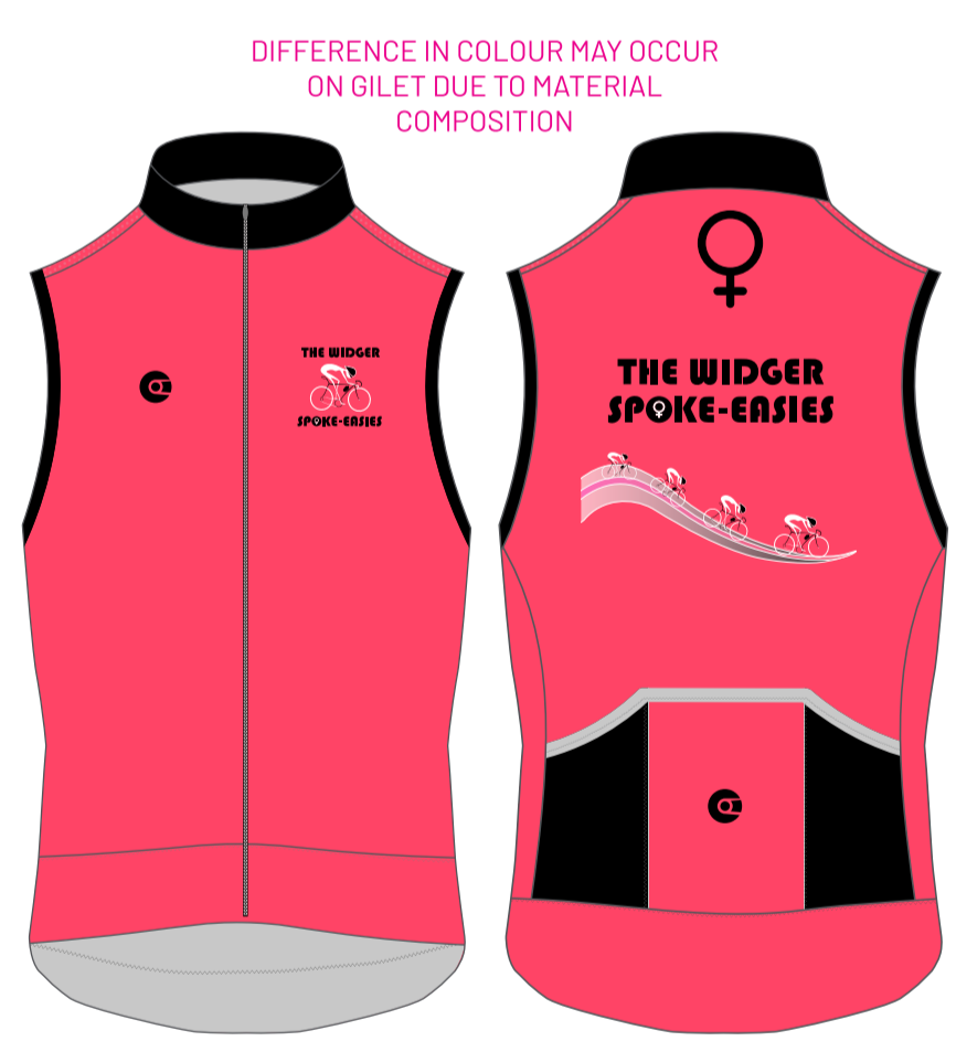
PRO-1 EVO GILET