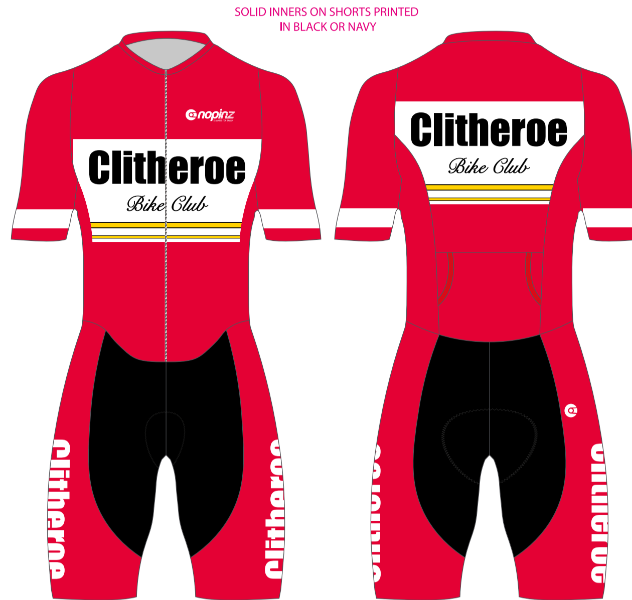
PRO 1 EVO SS TRI SUIT