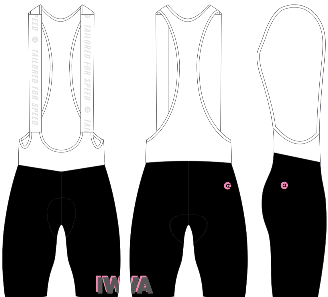
PRO-1 EVO BIB SHORTS