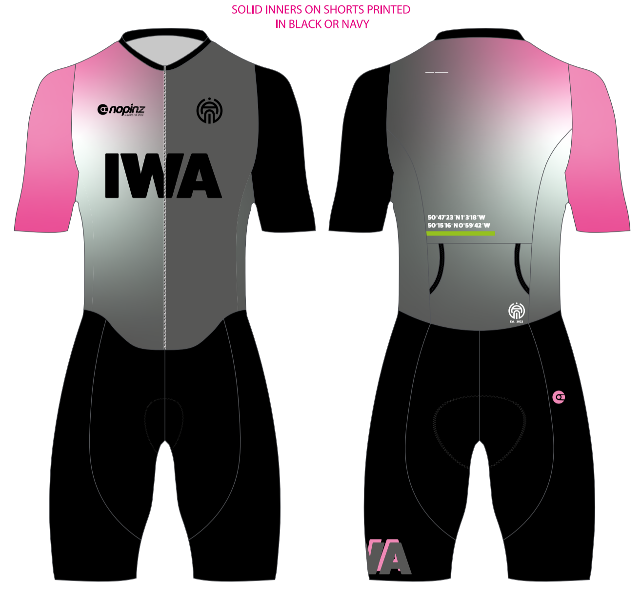
PRO 1 EVO SS TRI SUIT