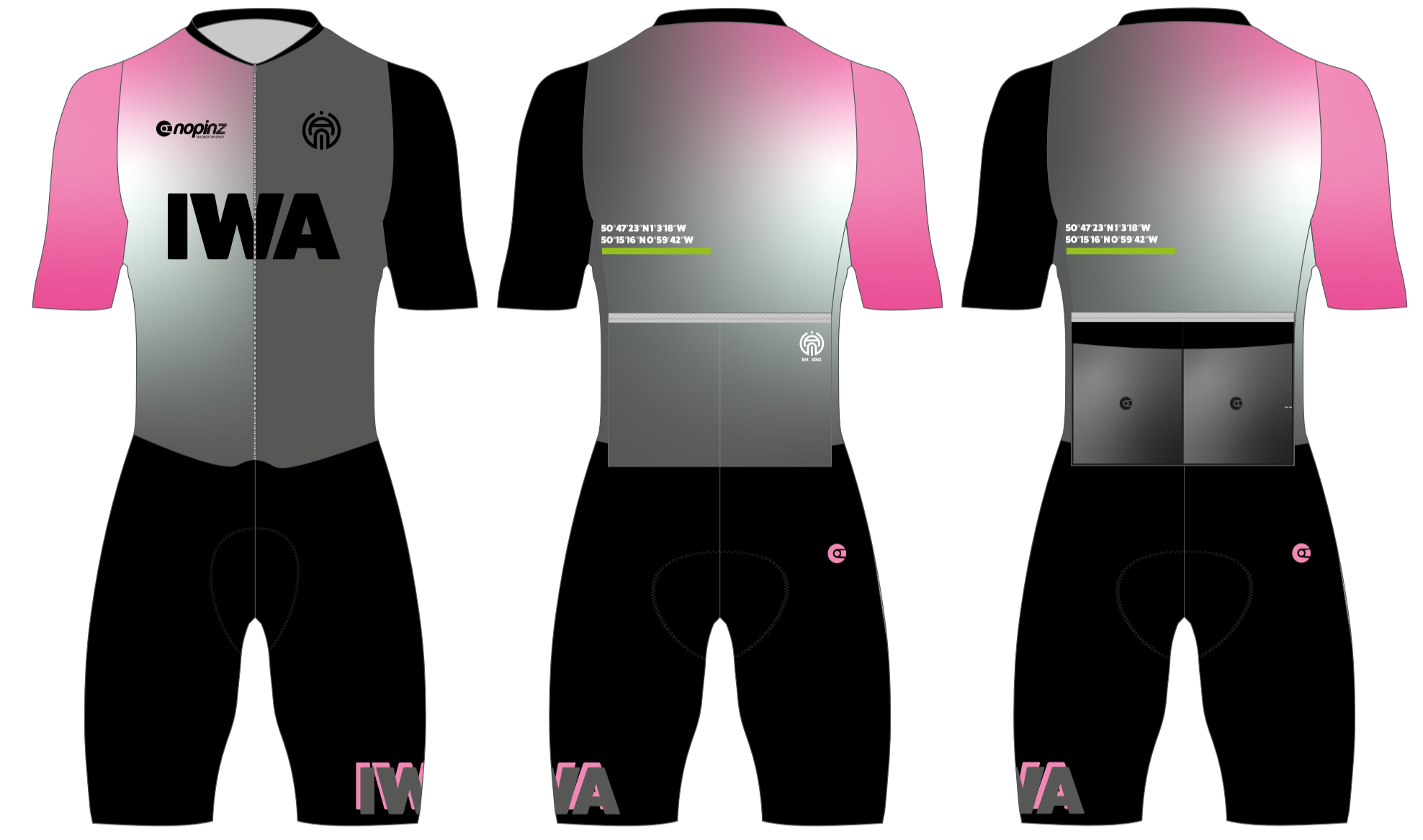
PRO-1 EVO RR SUIT