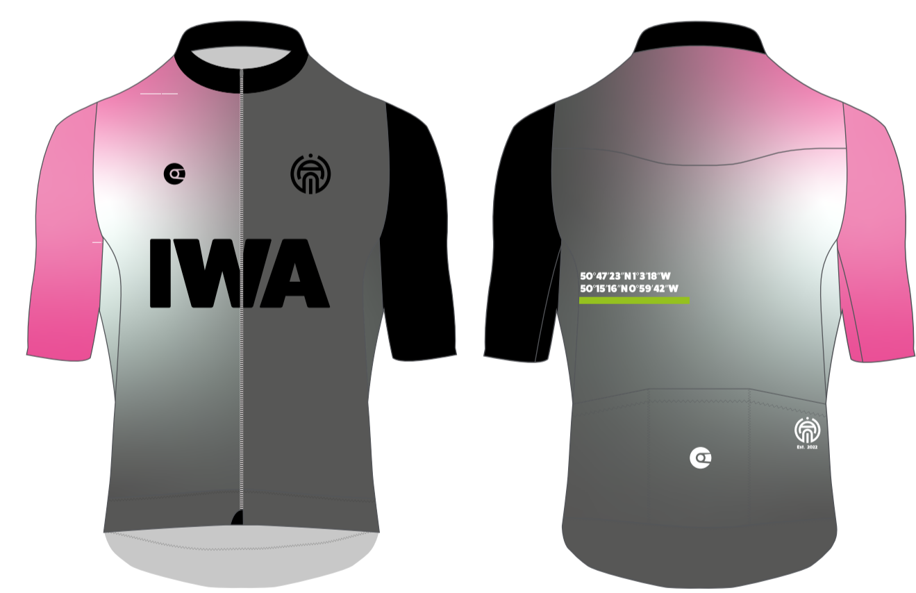
PRO-1 EVO MAX JERSEY