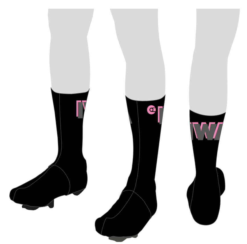
HYPERSONIC OVERSHOES UCI