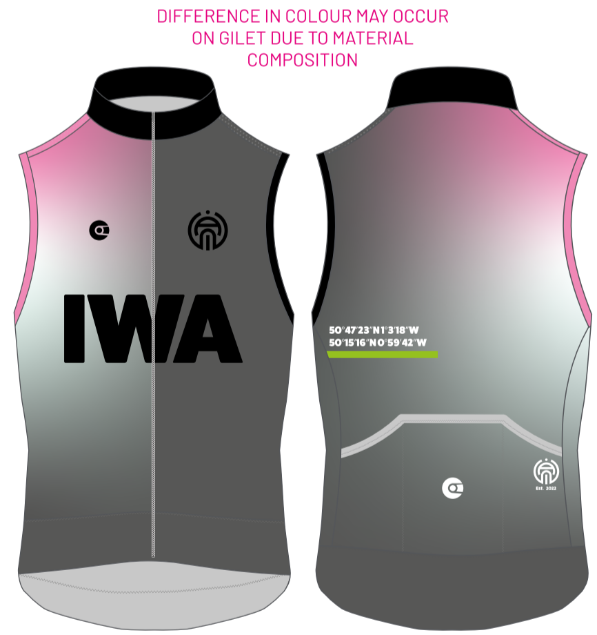
PRO-1 EVO GILET