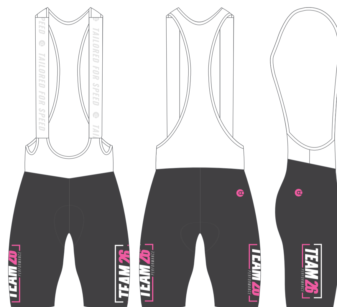
PRO-1 EVO BIB SHORTS