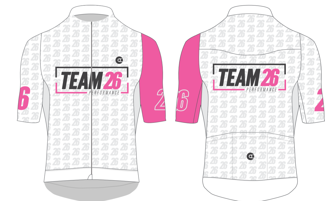
PRO-1 EVO MAX JERSEY