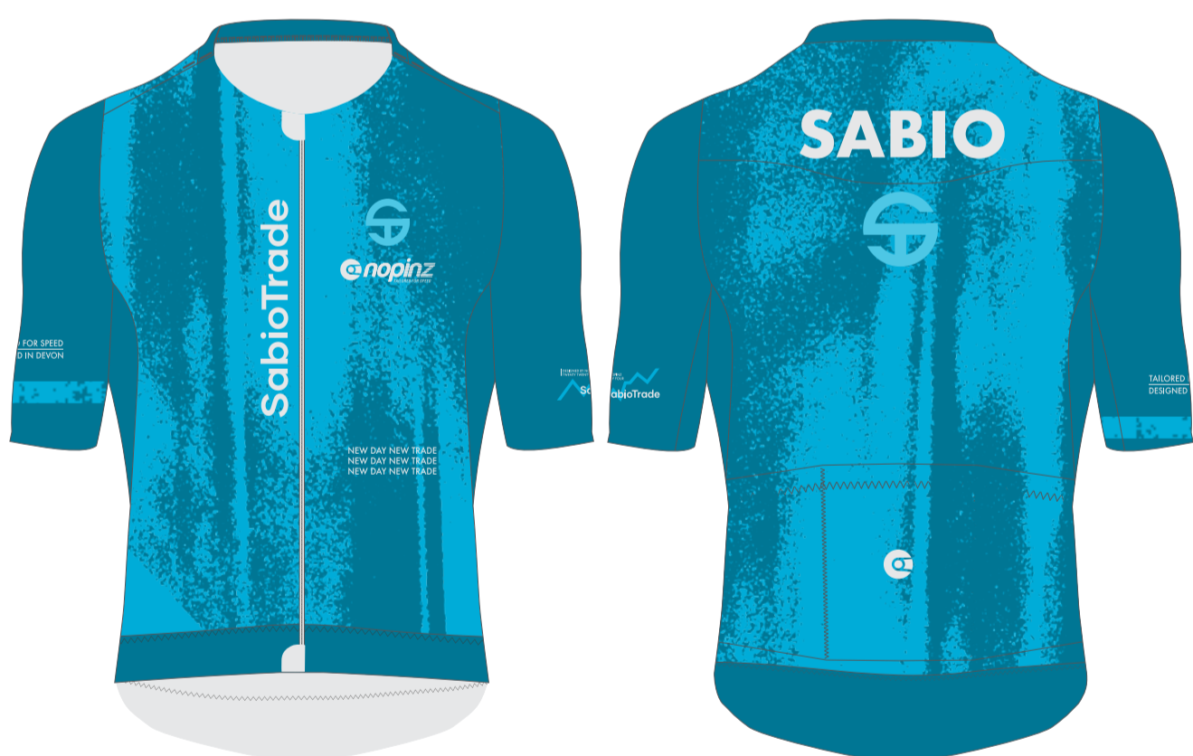
PRO-1 EVO MAX JERSEY