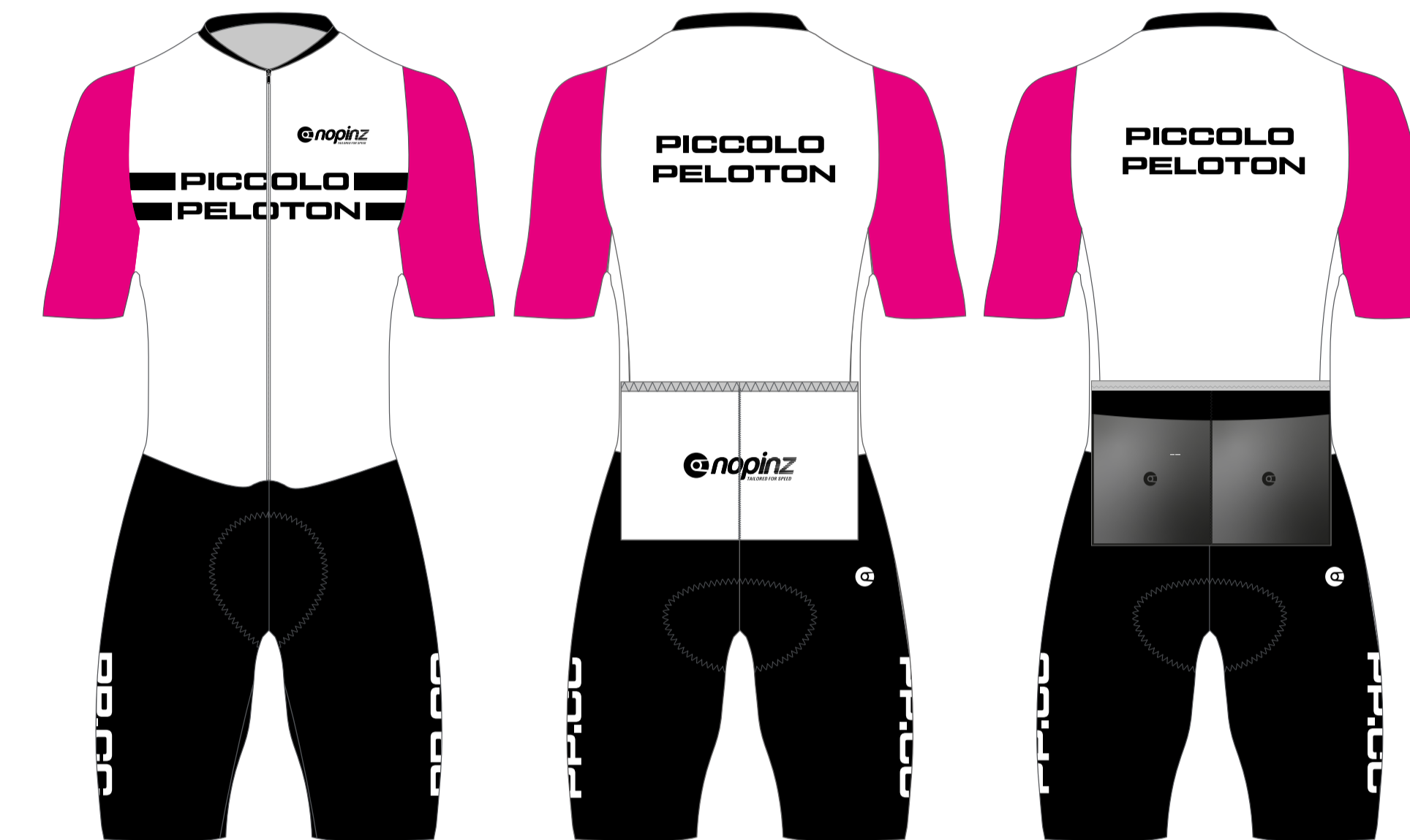
PRO-1 EVO RR SUIT