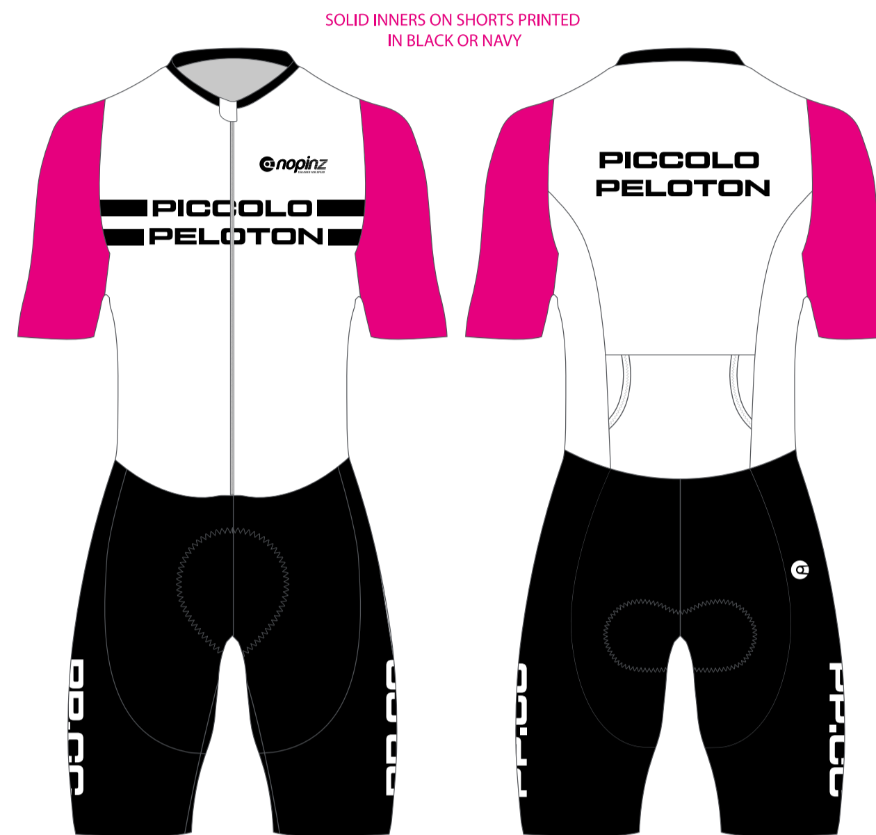
PRO 1 EVO SS TRI SUIT