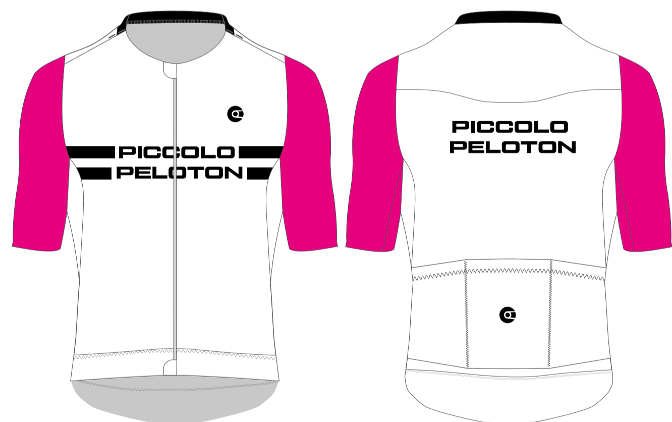
PRO-1 EVO MAX JERSEY