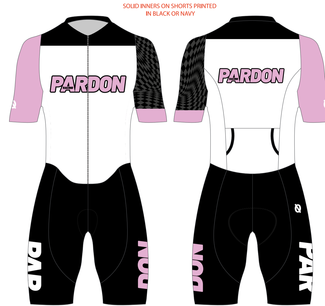
PRO 1 EVO SS TRI SUIT