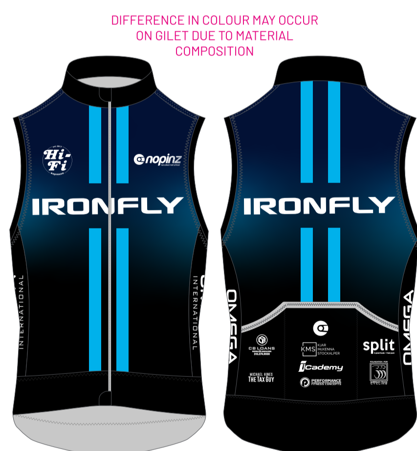
PRO-1 EVO GILET