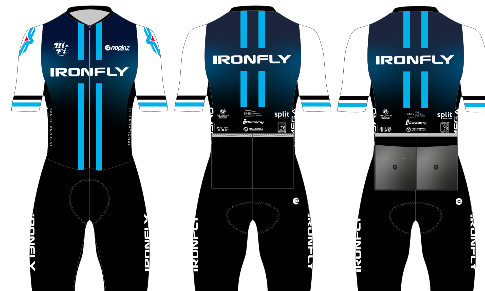
PRO-1 EVO RR SUIT