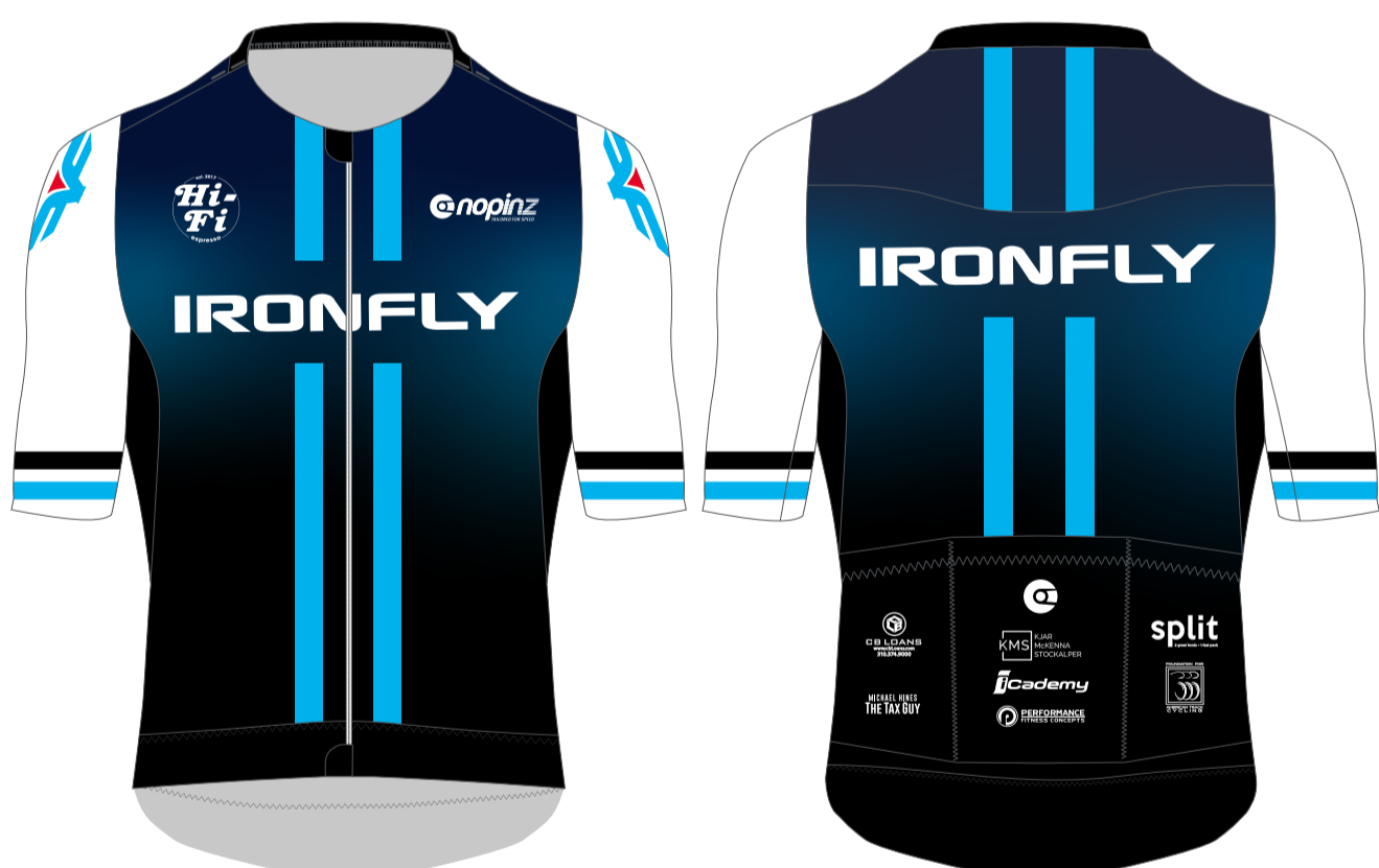
PRO-1 EVO MAX JERSEY