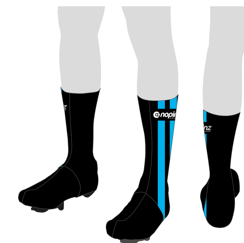
HYPERSONIC OVERSHOES UCI