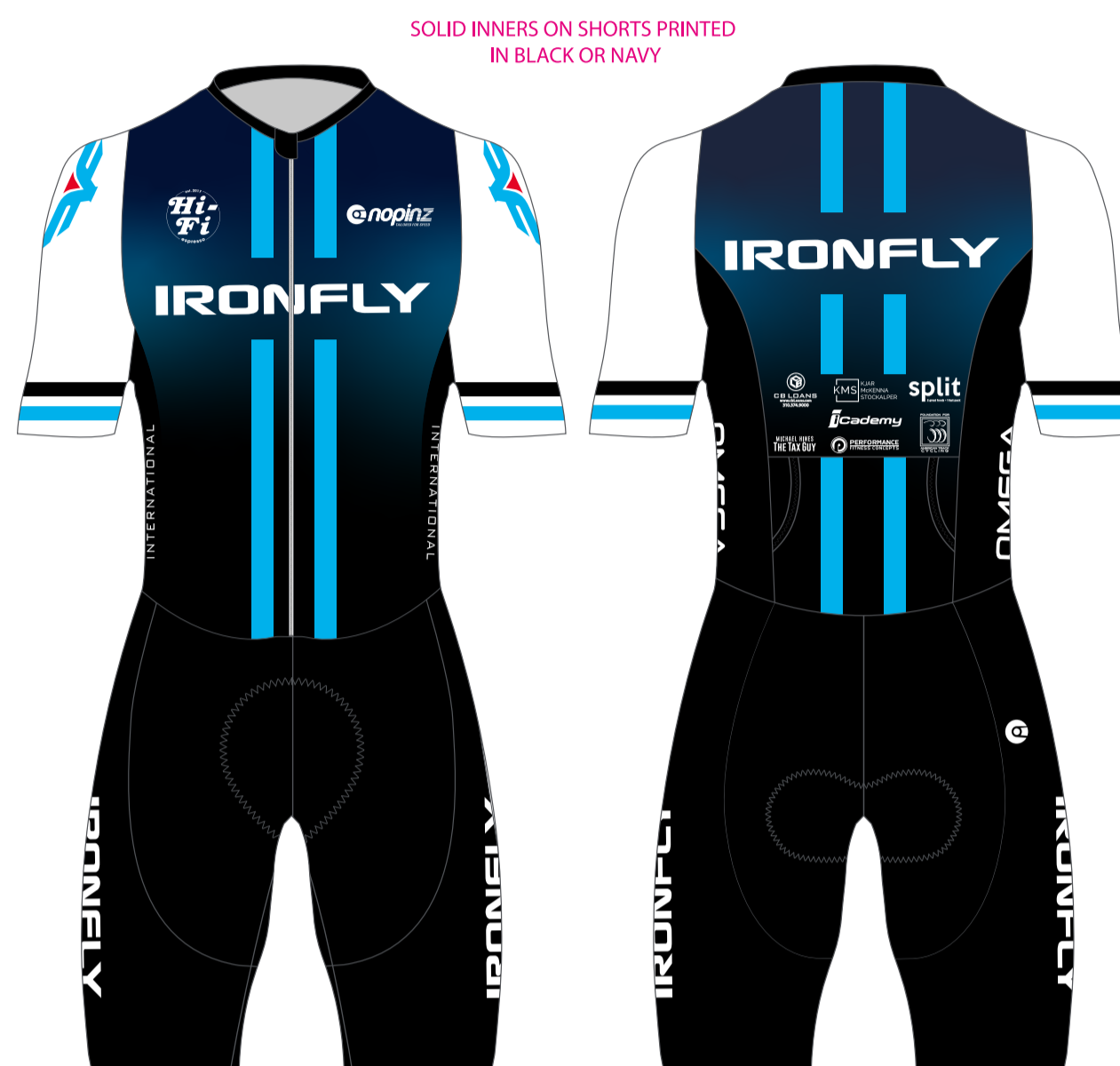
PRO 1 EVO SS TRI SUIT