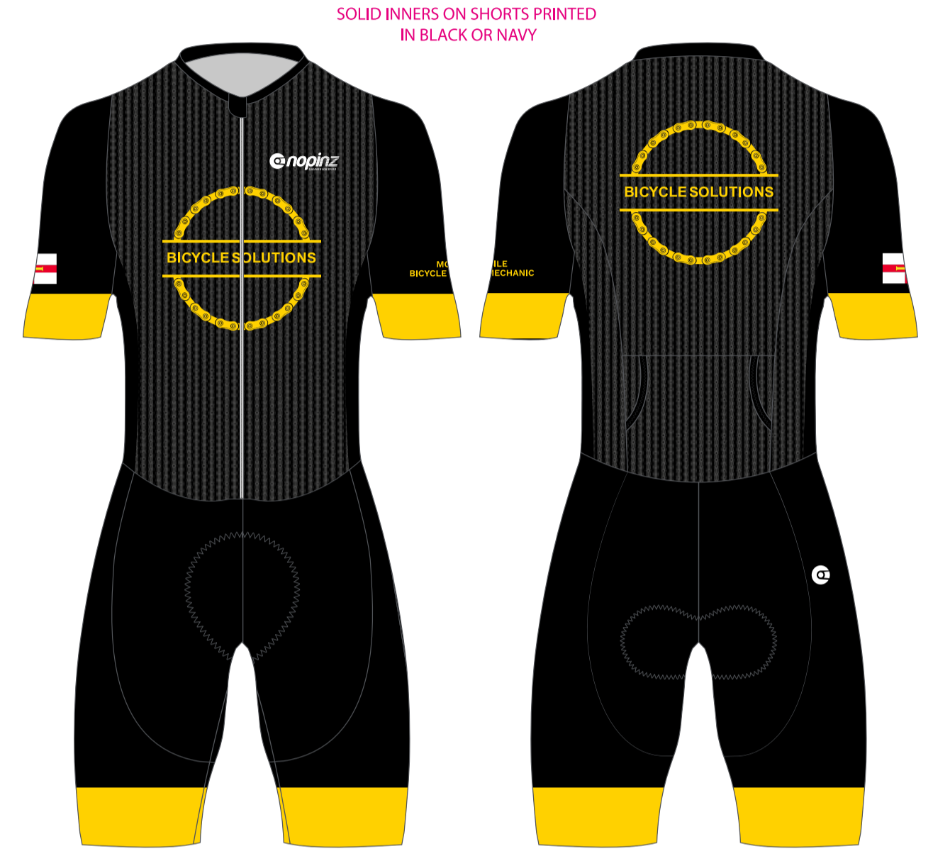
TRACK POCKET DESIGN