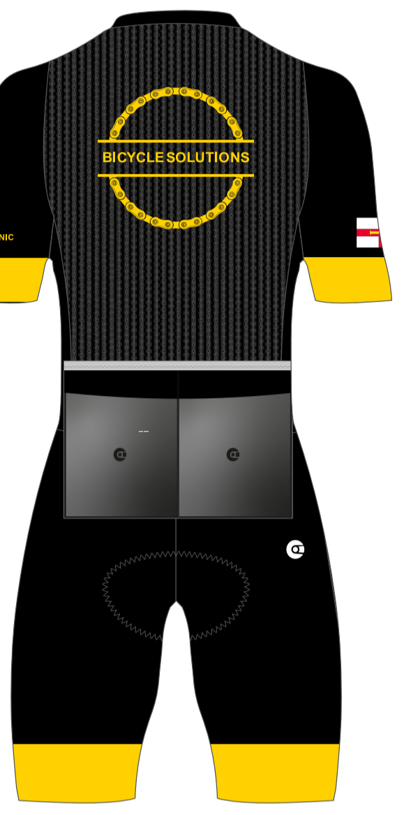
SPEED POCKET DESIGN