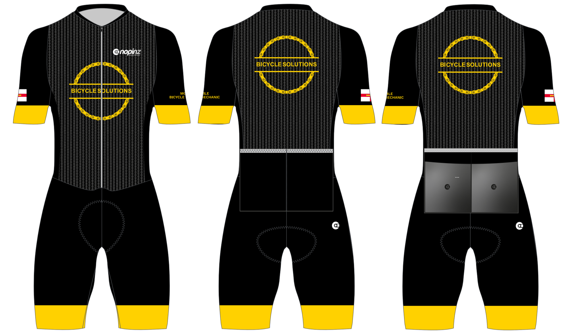
PRO 1 EVO SS TRI SUIT