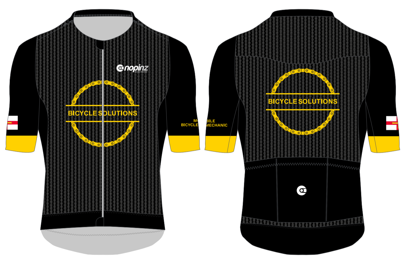
PRO-1 EVO MAX JERSEY