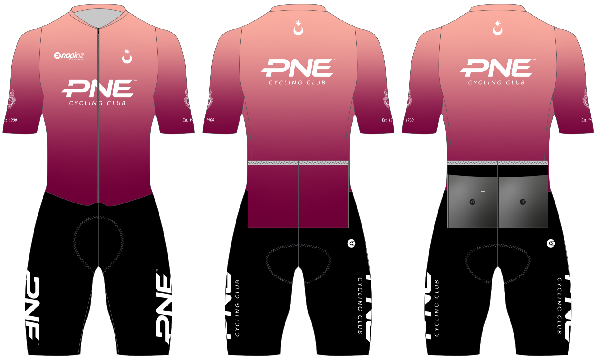
PRO-1 EVO RR SUIT