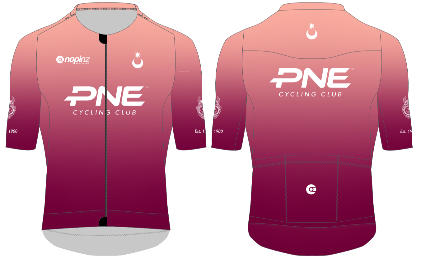
PRO-1 EVO MAX JERSEY