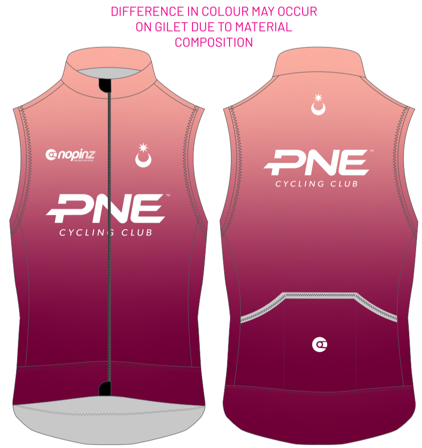
PRO-1 EVO GILET