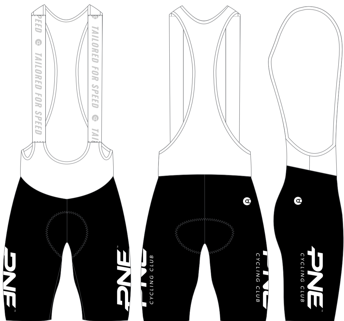
PRO-1 EVO BIB SHORTS