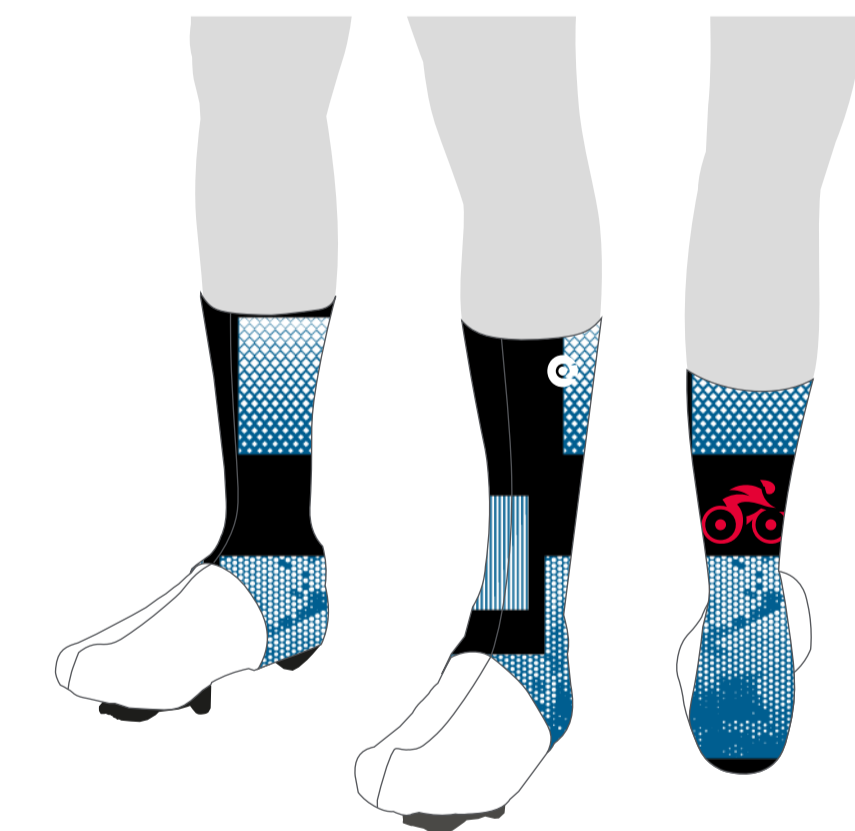
HYPERSONIC OVERSHOES UCI