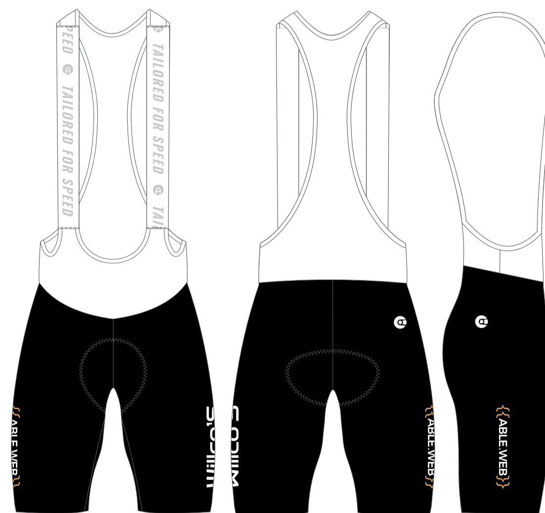
PRO-1 EVO BIB SHORTS