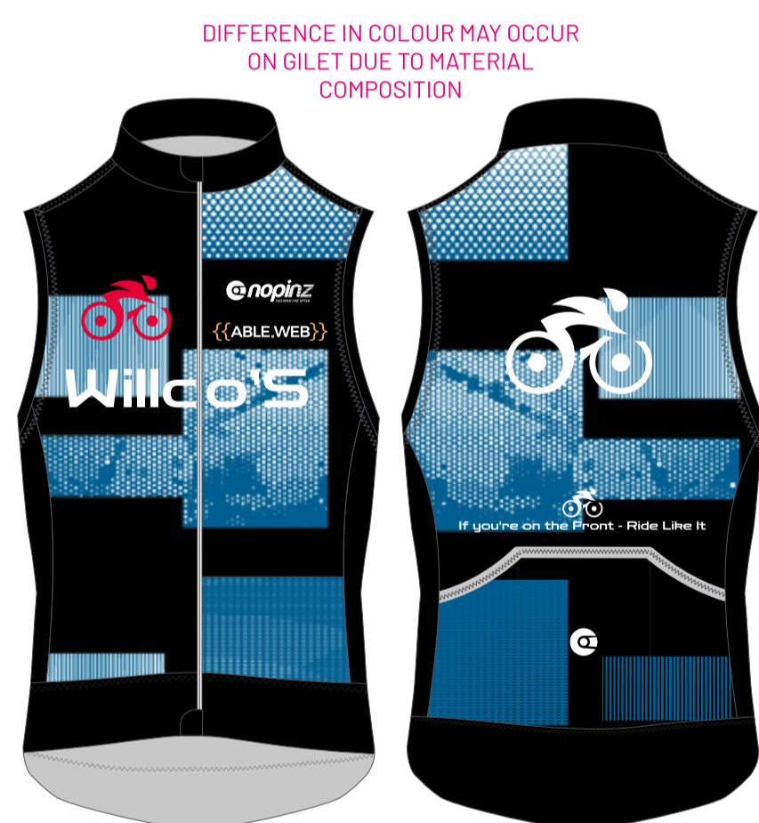
PRO-1 EVO GILET