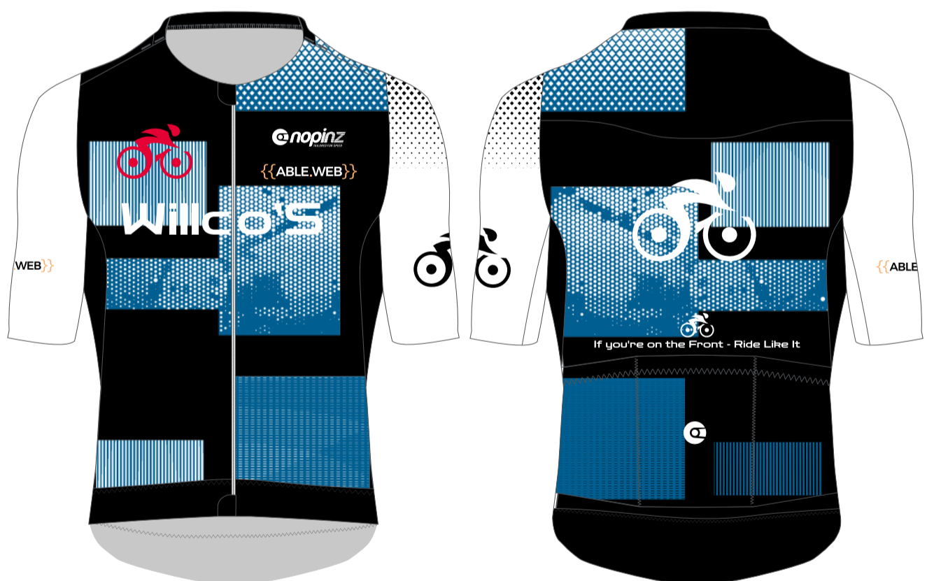
PRO-1 EVO MAX JERSEY