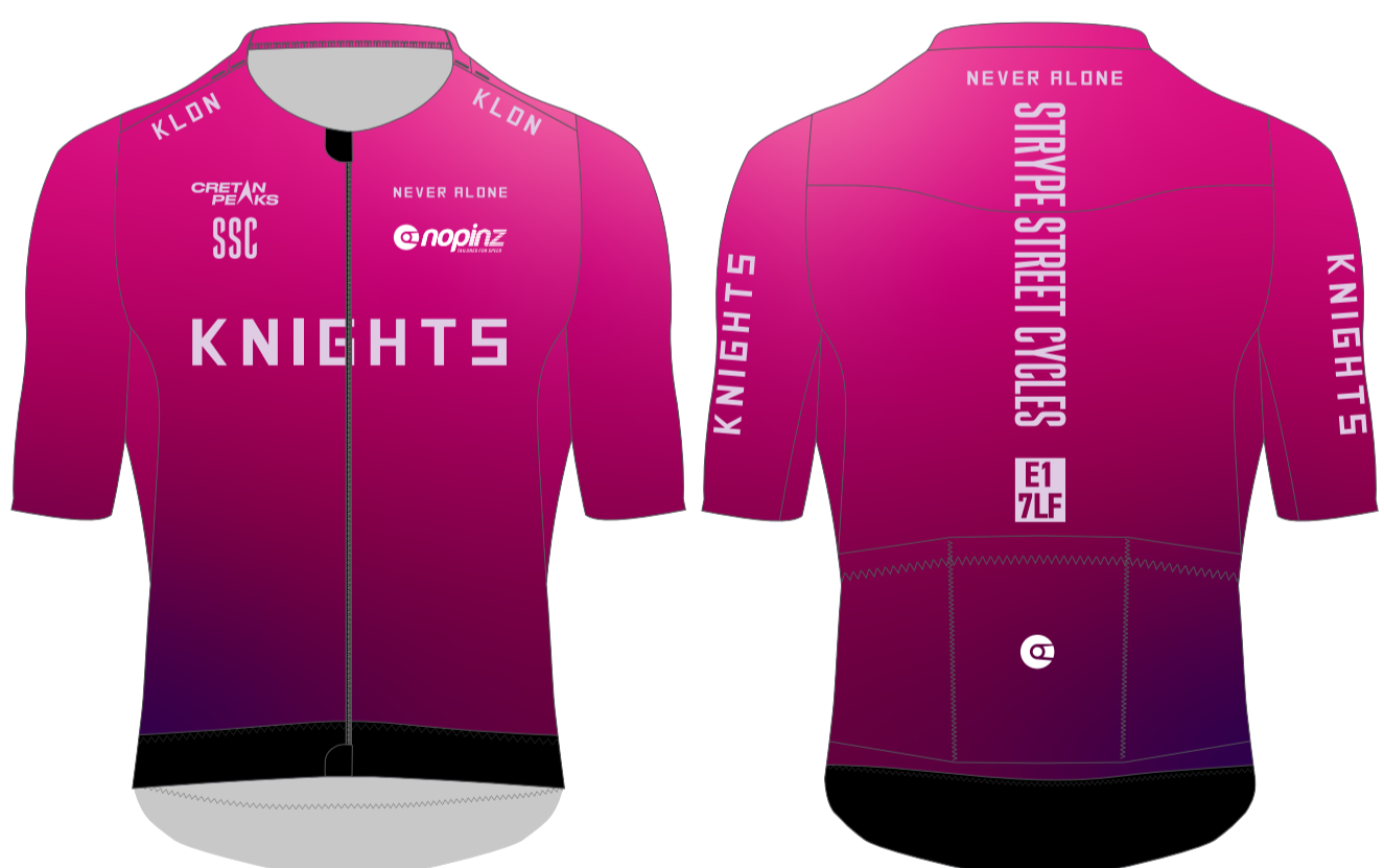
PRO-1 EVO MAX JERSEY