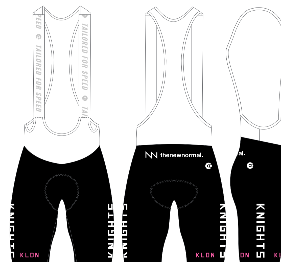
PRO-1 EVO BIB SHORTS