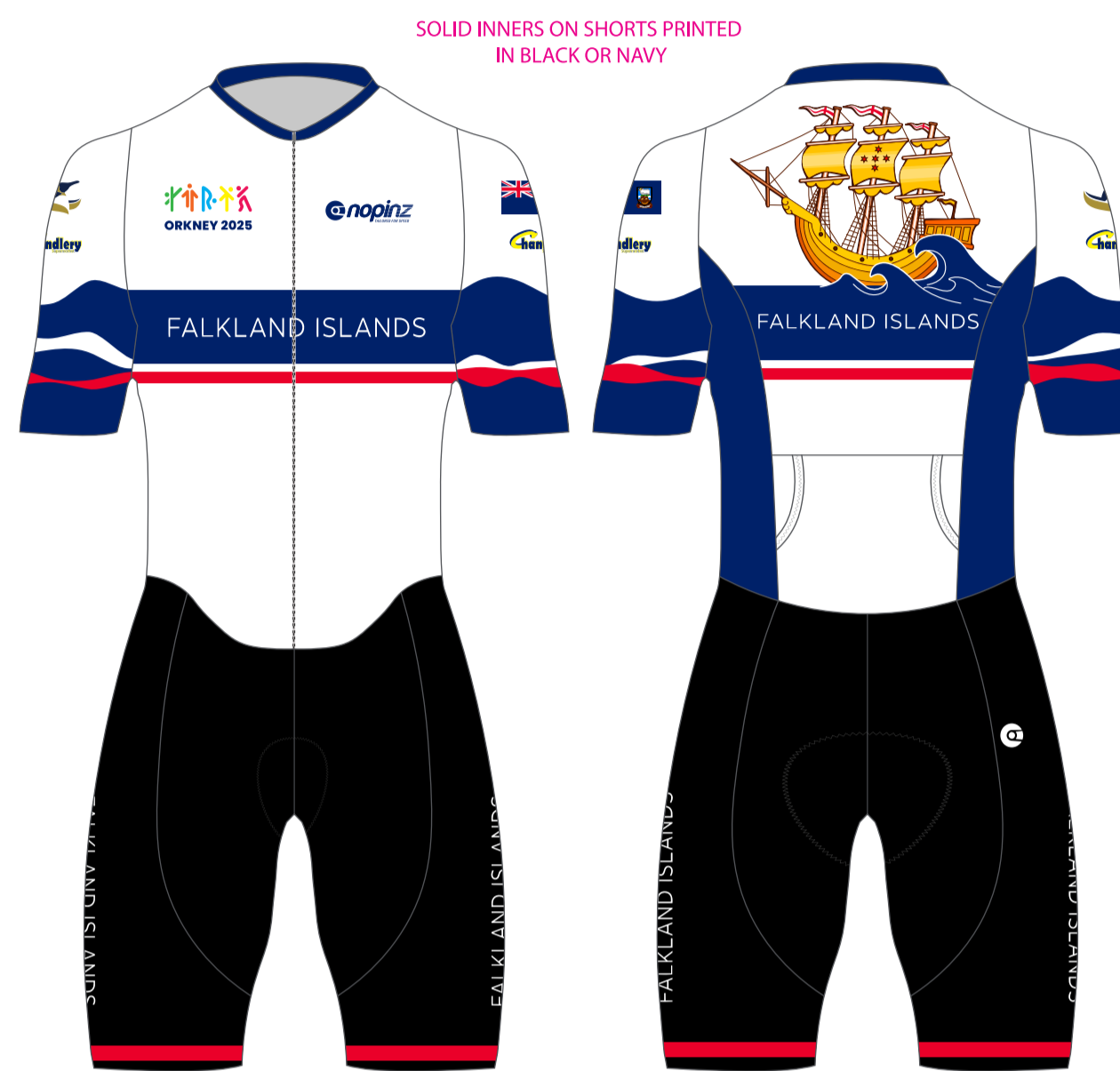
PRO 1 EVO SS TRI SUIT