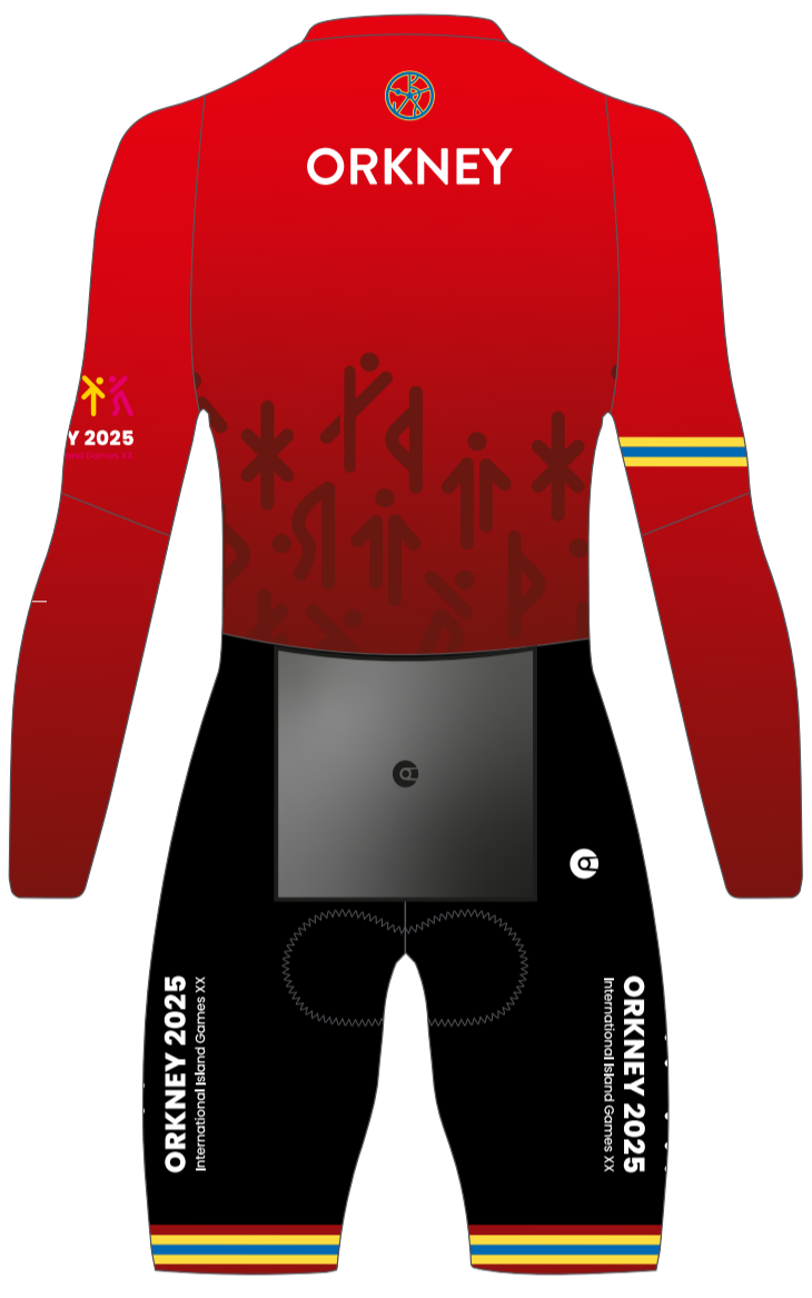
TRACK POCKET DESIGN