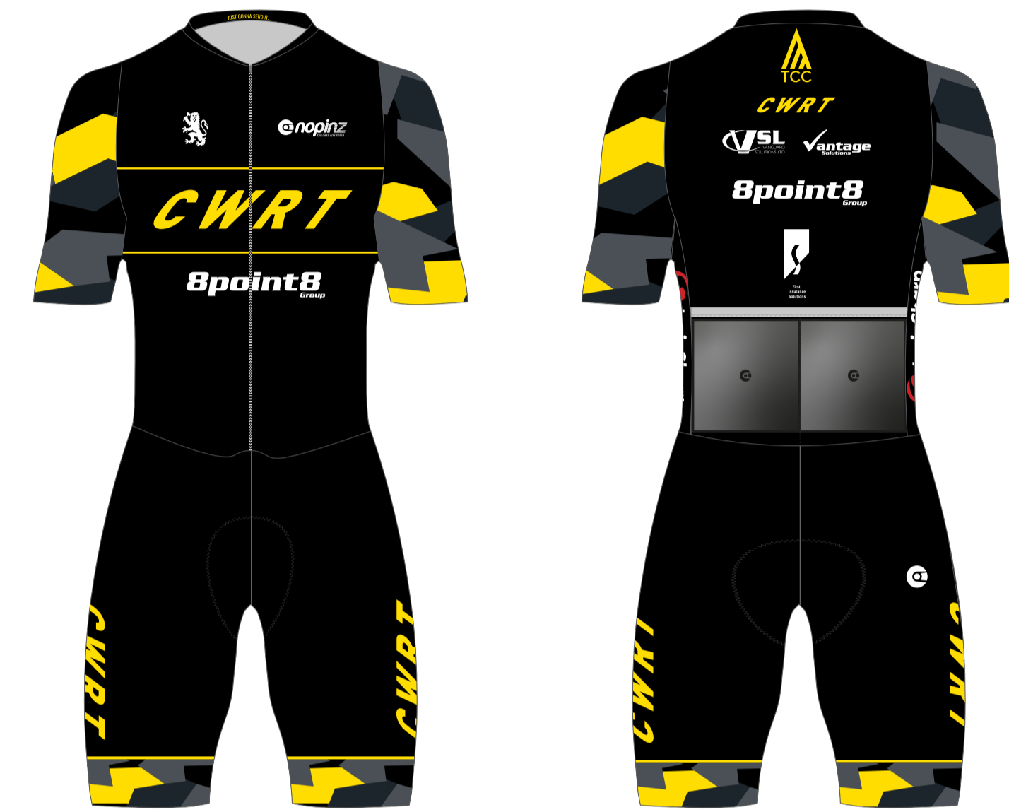
PRO1 ROAD RACE SUIT