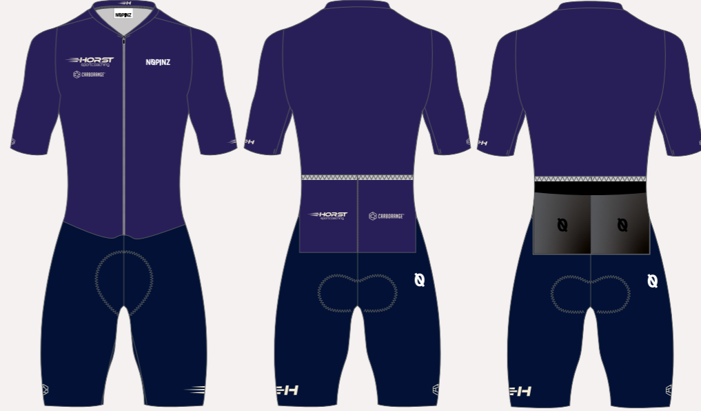
PRO-1 EVO RR SUIT