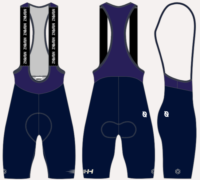
PRO-1 EVO BIB SHORTS