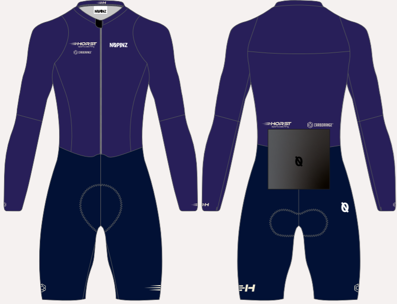
HYPERSONIC LIGHT SUIT