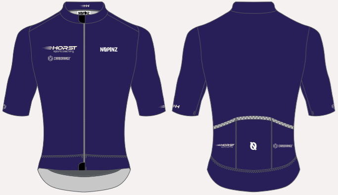
PRO-1 EVO JERSEY