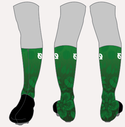
HYPERSONIC OVERSHOES UCI