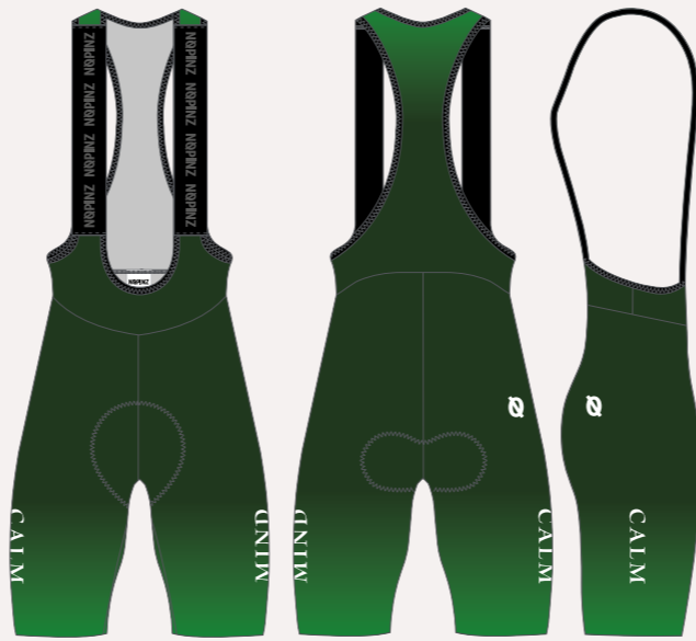
PRO-1 EVO BIB SHORTS