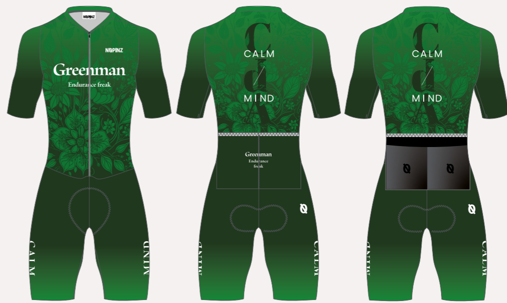
PRO-1 EVO RR SUIT