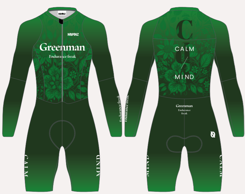
HYPERSONIC LIGHT SUIT