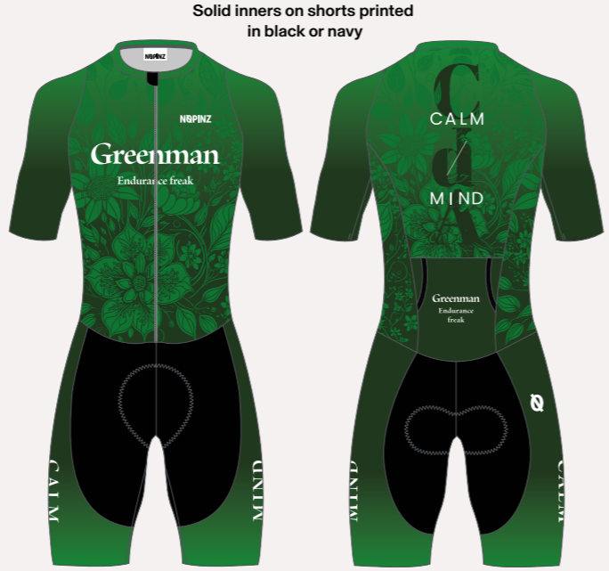
PRO 1 EVO TRISUIT