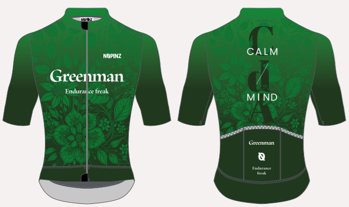
PRO-1 EVO JERSEY