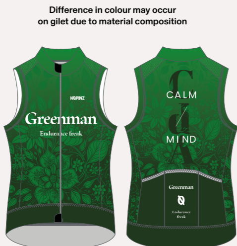
PRO-1 EVO GILET