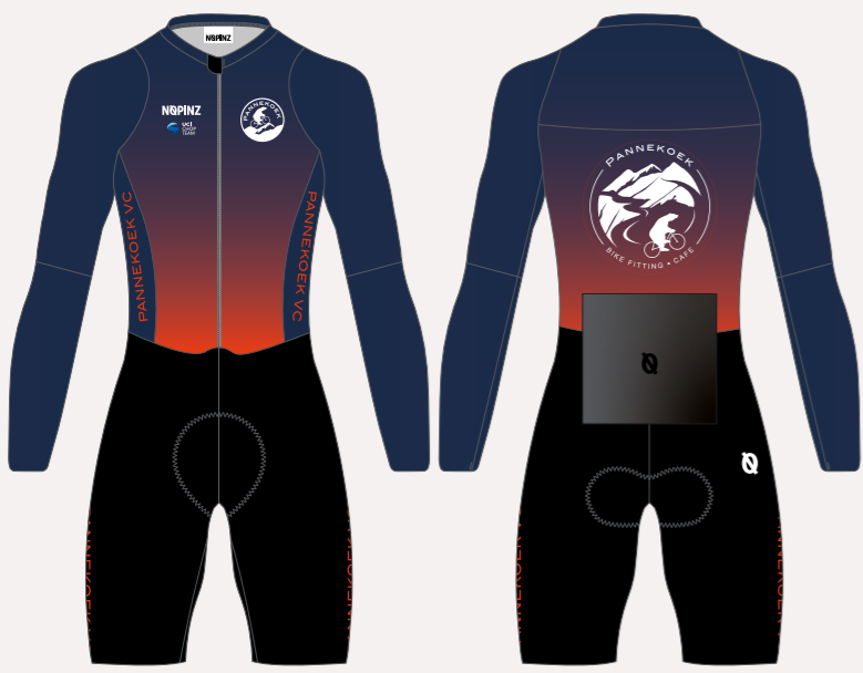
HYPERSONIC LIGHT SUIT