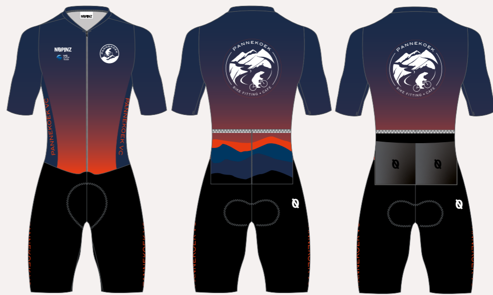
PRO-1 EVO RR SUIT