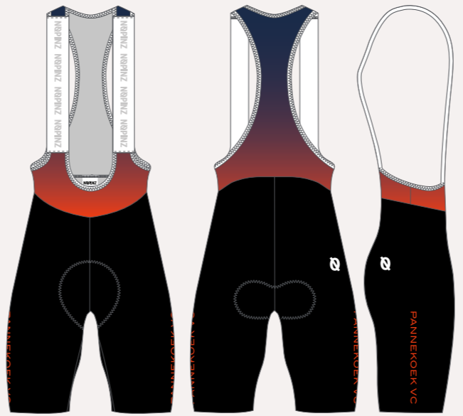
PRO-1 EVO BIB SHORTS