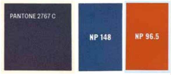
The best race team there never was

These visuals are an approximation in positioning and scale, exact sizes cannot be guaranteed. There is no guarantee artwork will line up across all seams. Colours will vary shades when printed on different fabrics. Screen colours do not look the same when printed on fabric. This club shop has been updated. Customer has provided all logos in vector format. Printed colours have been approved via email.