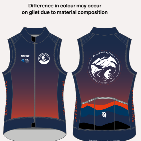
PRO-1 EVO GILET