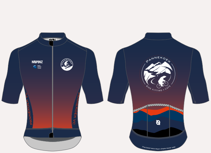
PRO-1 EVO JERSEY