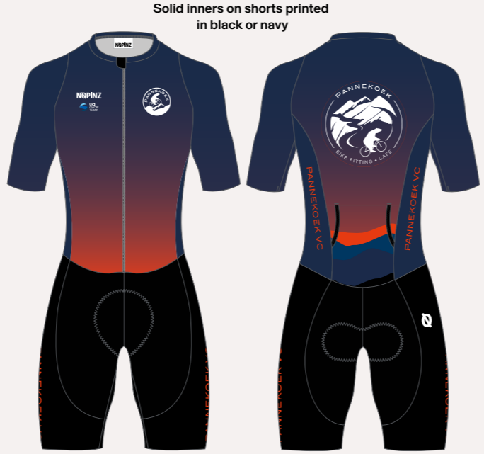
PRO 1 EVO TRISUIT