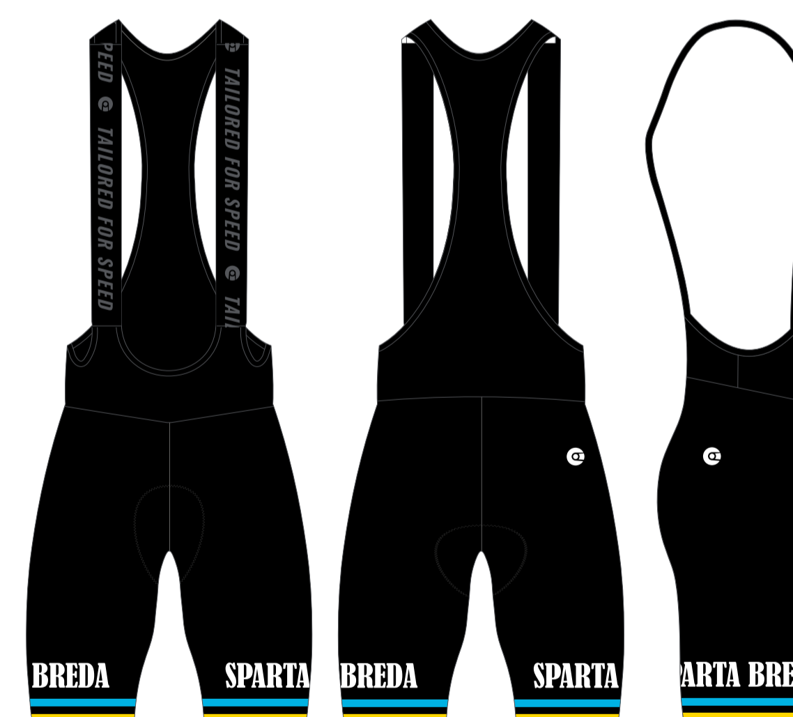
PRO-1 EVO BIB SHORTS