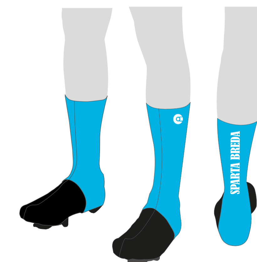
HYPERSONIC OVERSHOES UCI