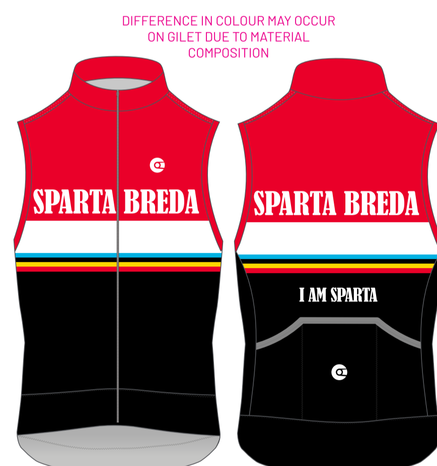
PRO-1 EVO GILET