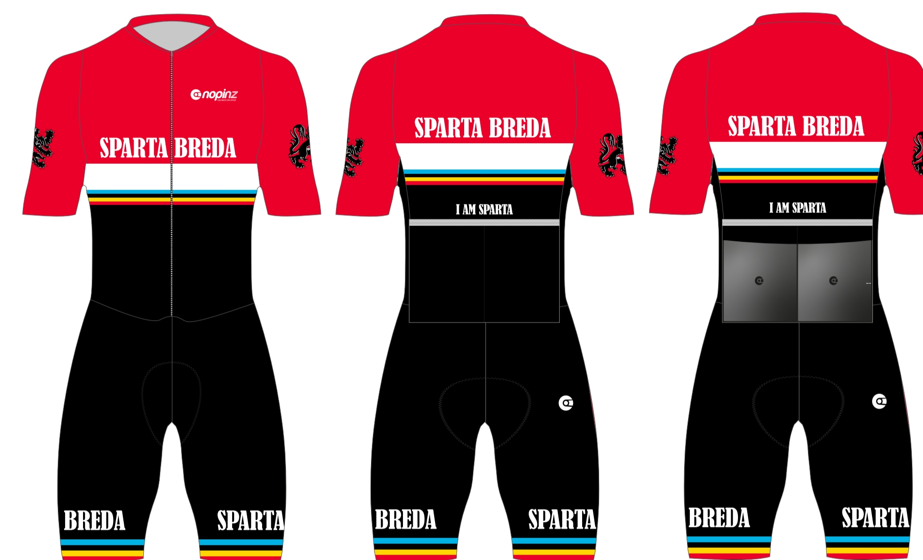
PRO-1 EVO RR SUIT