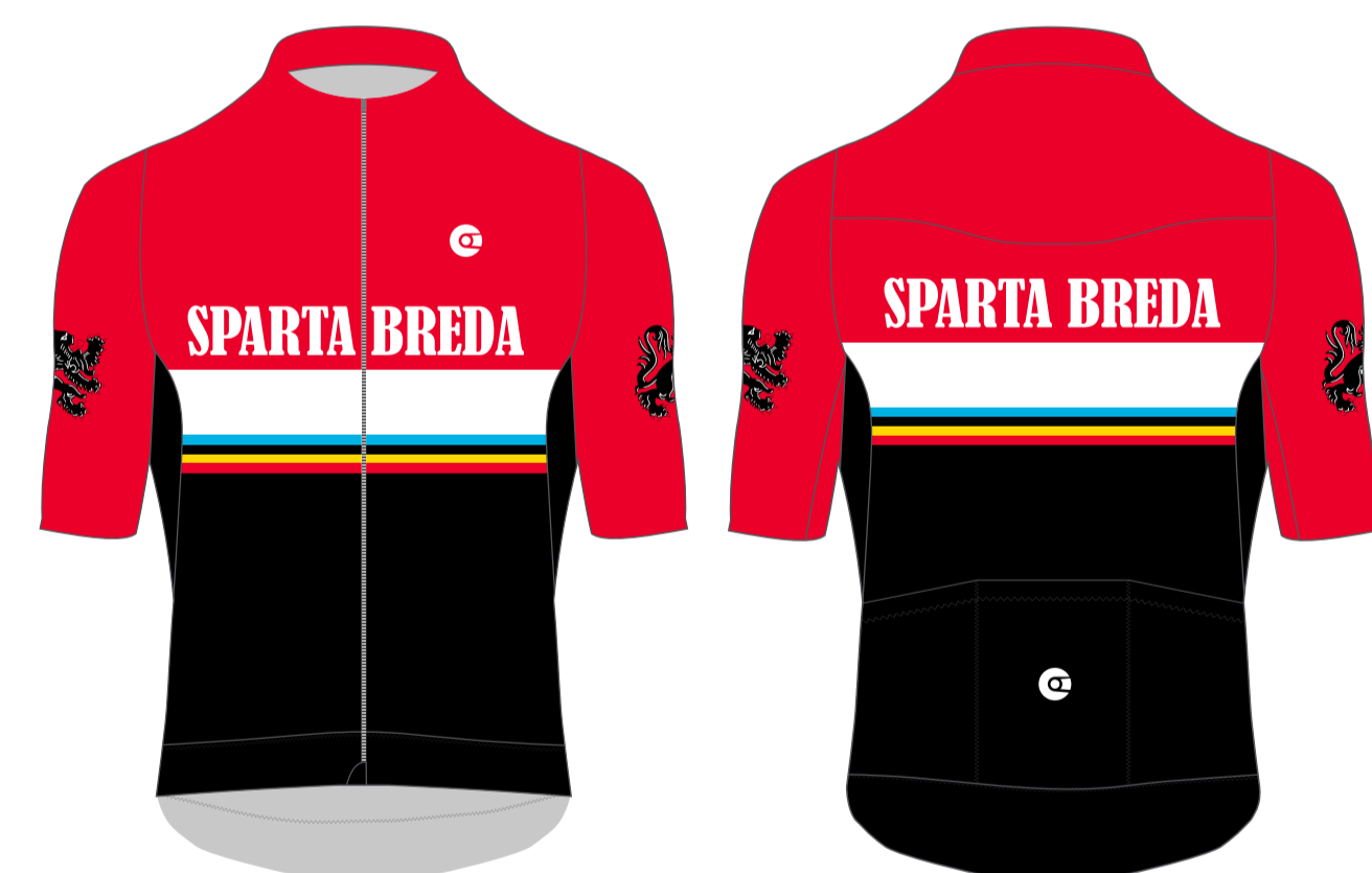
PRO-1 EVO MAX JERSEY