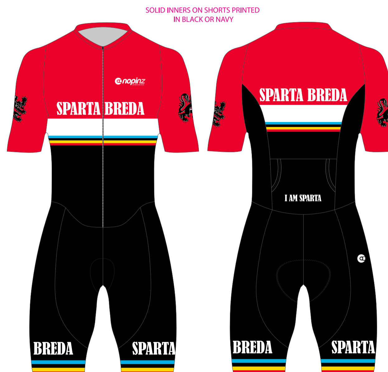
PRO 1 EVO SS TRI SUIT