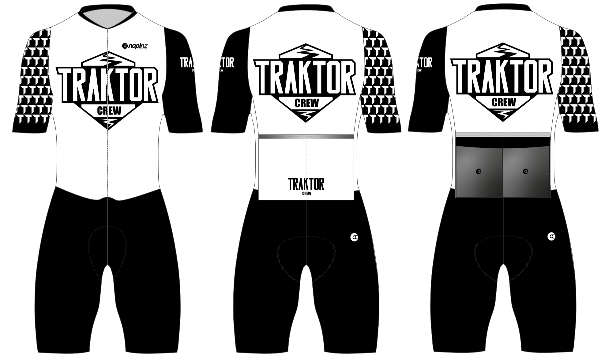
PRO-1 ROAD SKINSUIT