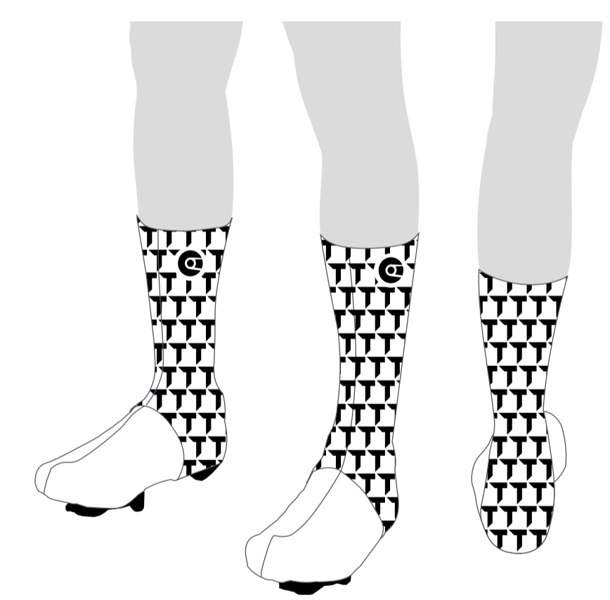
HYPERSONIC OVERSHOES UCI