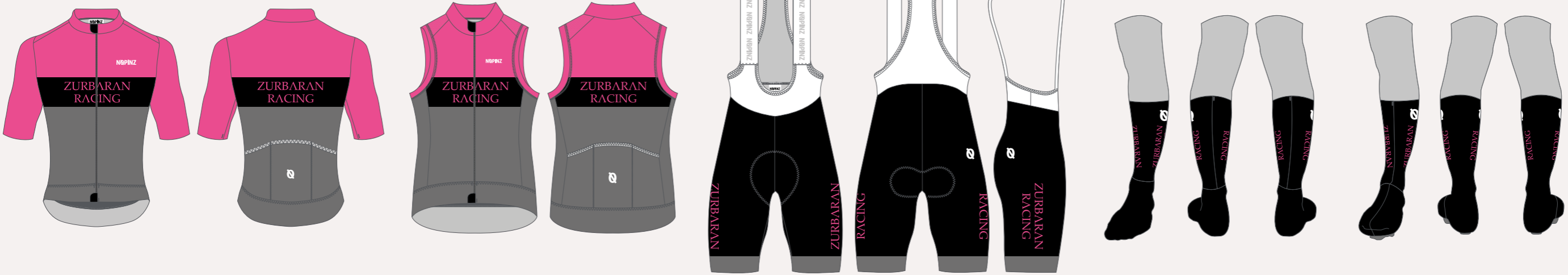
PRO-1 EVO JERSEY

Difference in colour may occur on gilet due to material composition