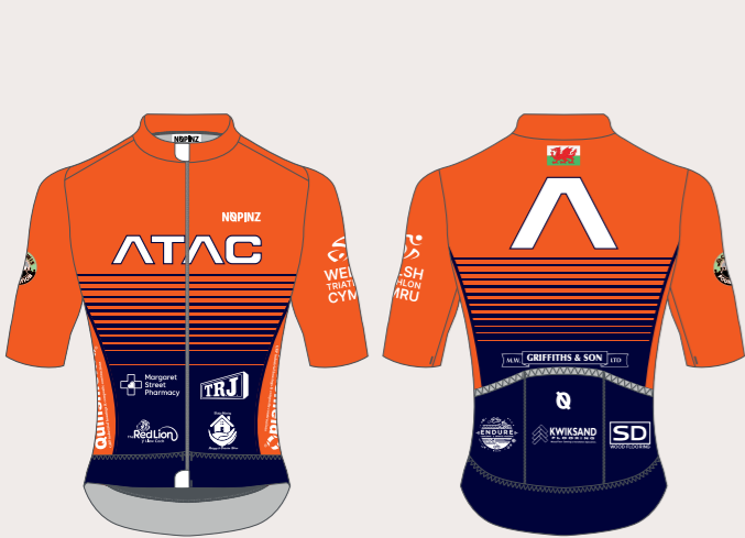
PRO-1 EVO JERSEY