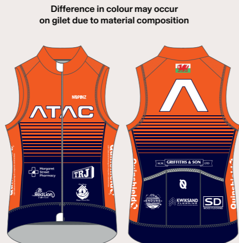
PRO-1 EVO GILET