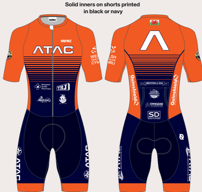
PRO 1 EVO TRISUIT