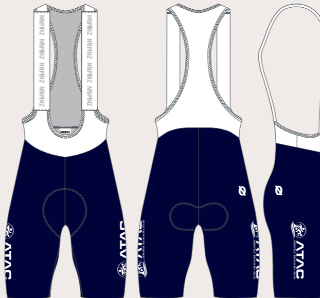
PRO-1 EVO BIB SHORTS