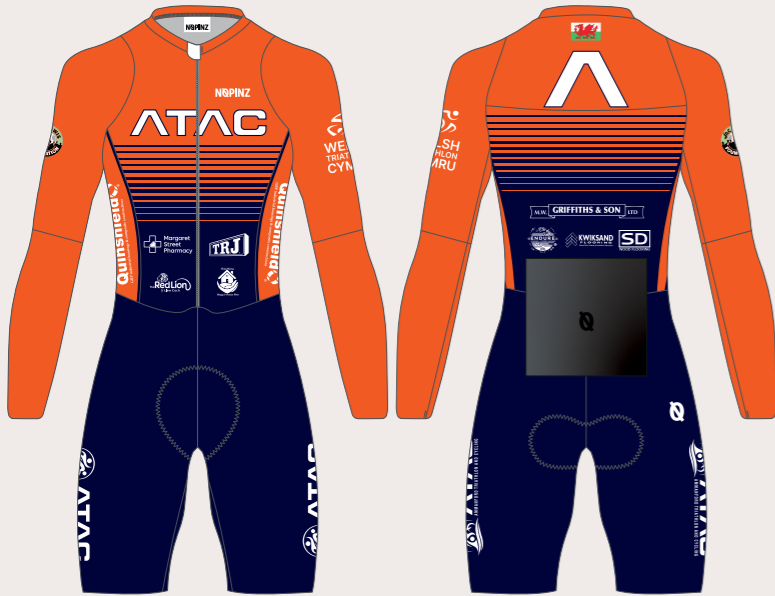
HYPERSONIC LIGHT SUIT