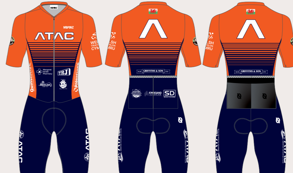
PRO-1 EVO RR SUIT